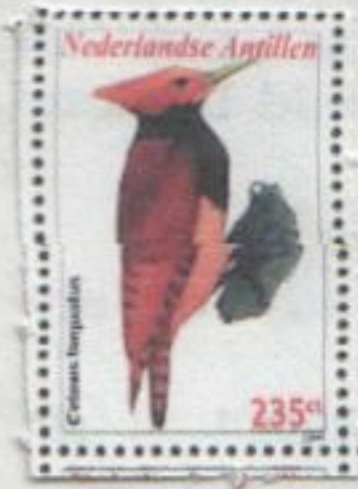
RINGED WOODPECKER, Celeus torquatus Picidae Netherlands Antilles, 2009, not yet cataloged, 235 c