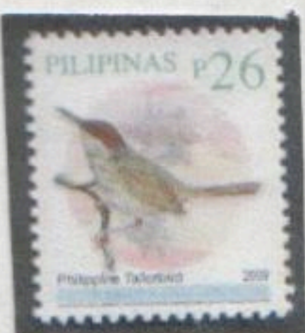
PHILIPPINE TAILORBIRD, Orthotomus castaneiceps Sylviidae Philippines, 2009, not yet cataloged, 26 p