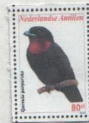
PURPLE-THROATED FRUITCROW, Querula purpurata Cotingidae Netherlands Antilles, 2009, not yet cataloged, 80 c