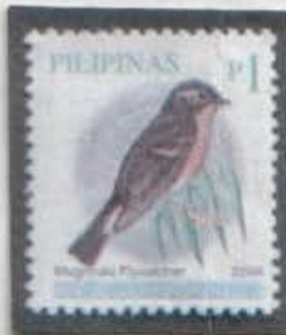
MUGIMAKI FLYCATCHER, Ficedula mugimaki Muscicapidae Philippines, 2009, not yet cataloged, 1 peso