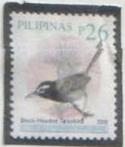
WHITE-BROWED TAILORBIRD, Orthotomus nigriceps Sylviidae Philippines, 2009, not yet cataloged, 26 p