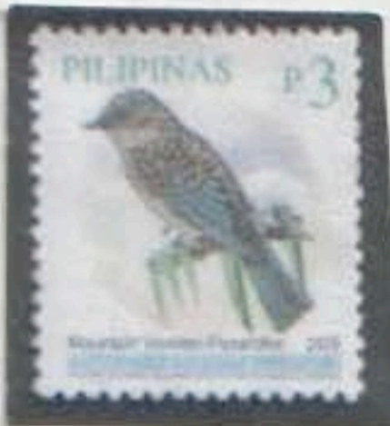
ISLAND FLYCATCHER, Eumyias panayensis Muscicapidae Philippines, 2009, not yet cataloged, 3 pesos