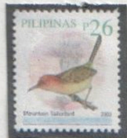
MOUNTAIN TAILORBIRD, Orthotomus cuculatus Sylviidae Philippines, 2009, not yet cataloged, 26 p