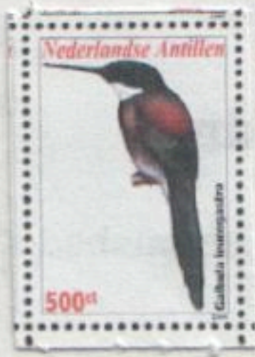
BRONZY JACAMAR, Galbula leucogastra Galbulidae Netherlands Antilles, 2009, not yet cataloged, 500 c

Length: 8 to 9 inches, resident. The male (shown on the stamp) has a green crown and metallic bronzy-green back and breast with a black chin and white throat; the female has a buffy throat and belly.