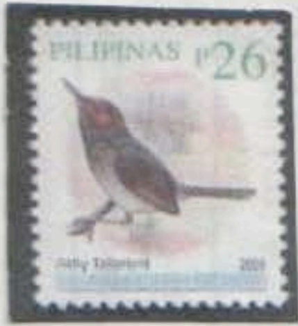
ASHY TAILORBIRD, Orthotomus ruficeps Sylviidae Philippines, 2009, not yet cataloged, 26p

Length: 5 inches, resident. The male (shown on the stamp) is gray with a rufous-chestnut face; the female has a white chin and throat.