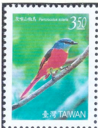
GRAY-CHINNED MINIVET , Pericrocotus solaris Campephagidae (123.080)