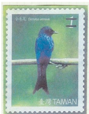
BRONZED DRONGO , Dicrurus aeneus Dicruridae (178.014) China (Taiwan), 2008, not yet cataloged, $1

Reference: Harris, T. and K. Franklin. Shrikes and Bush-Shrikes