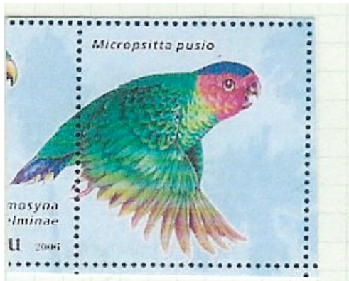
BUFF-FACED PYGMY-PARROT , Micropsitta pusio Psittacidae (074.059) Guinea-Bissau, 2007, not yet cataloged, label

Length: 3 inches, sexes alike, resident. Green with a buff face and a deep-blue crown. Habitat: lowland forest and dense savanna. Range: New Guinea. Reference: del Hoyo, J., A. Elliott and J. Sargatal, Eds. Handbook of the Birds of the World, Volume 4.