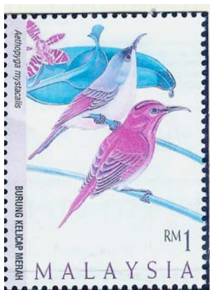
TEMMINCK'S SUNBIRD , Aethopyga temminckii Nectariniidae (164.120) Malaysia, 1997, 608, $1