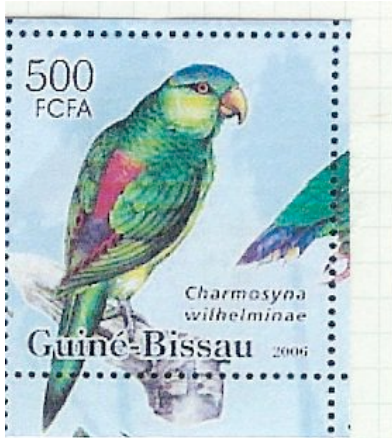
PYGMY LORIKEET , Charmosyna wilhelminae Psittacidae (074.042) Guinea-Bissau, 2007, not yet cataloged, 500 francs

Length: 5 inches, resident. The male (shown on the stamp) is green with a purple crown, yellow breast streaks and a red rump; the female lacks the red rump.