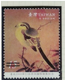
CHINESE GRAY SHRIKE , Lanius sphenocercus Laniidae (174.017) China (Taiwan), 2008, not yet cataloged, $15