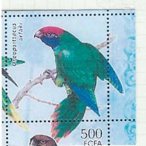
PLUM-FACED LORIKEET , Oreopsitta arfaki Psittacidae (074.050)

Guinea-Bissau, 2007, not yet cataloged, label