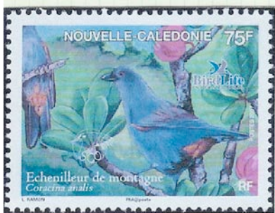
NEW CALEDONIAN CUCKOO-SHRIKE , Coracina analis Campephagidae (123.022)