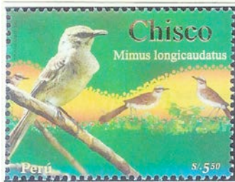
LONG-TAILED MOCKINGBIRD , Mimus longicaudus Mimidae (134.011)