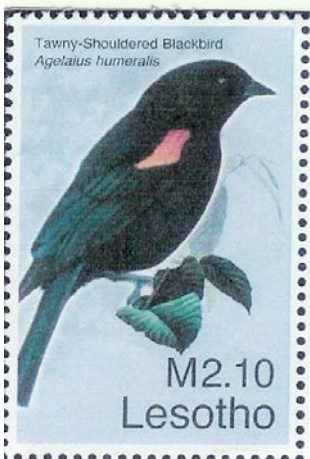
TAWNY-SHOULDERED BLACKBIRD, Agelaius humeralis Icteridae (203.003) Lesotho, 2007, not yet cataloged, 2.10m

Length: 6 to 6.5 inches, sexes similar, but the female is slightly duller, resident. Rich brown above and buff brown below with black cap, wings and tail and white cheeks and rump. Habitat: moist oak forest. Range: Northern Luzon and Mindanao mountains. Clement, P., A. Harris and J. Davis. Finches and Sparrows.