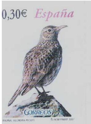
DUPONT'S LARK , Chersophilus duponti Alaudidae (120.051) Spain, 2007, not yet cataloged, 0.30 euro

Length: 7 inches, sexes similar, resident. Rufous brown above and whiteish belly with a streaked breast and neck and a long curved bill.