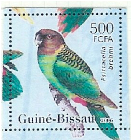
BREHM'S TIGER-PARROT , Psittacella brehmii Psittacidae (074.107) Guinea-Bissau, 2007, not yet cataloged, 500 francs

Length: 3 inches, sexes alike, resident. Green with a buff face and a deep-blue crown. Habitat: lowland forest and dense savanna. Range: New Guinea. Reference: del Hoyo, J., A. Elliott and J. Sargatal, Eds. Handbook of the Birds of the World, Volume 4.