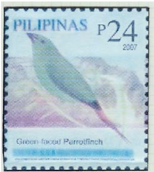
GREEN-FACED PARROTFINCH, Erythrura viridifacies Estrildidae (191.092) Philippines, 2007, not yet cataloged, 24p

Length: 15 inches, sexes alike, resident. Dull brown above and pale gray nape, rump and below with a black face and a small white patch on black wings. Habitat: forest, scrub and second growth. Range: Taiwan to India and Southeast Asia. Reference: King, B.F. and E. C. Dickenson. A Field Guide to the Birds of South-East Asia.