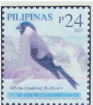
WHITE-CHEEKED BULLFINCH, Pyrrhula leucogenis Fringillidae (194.155) Philippines, 2007, not yet cataloged, 24p