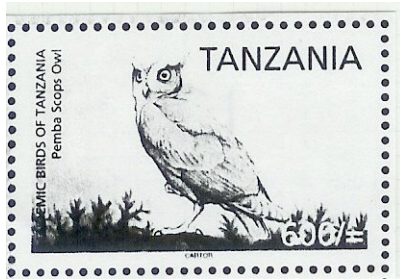
PEMBA SCOPS-OWL , Otus pembaensis Strigidae (078.036) Tanzania, 2006, not yet cataloged, 600 shillings

Reference: del Hoyo, J., A. Elliott and J. Sargatal, Eds. Handbook of the Birds of the World, Volume 4.