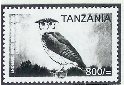
USAMBARA EAGLE-OWL , Bubo vosseleri Strigidae (078.078) Tanzania, 2006, not yet cataloged, 800 shillings

Reference: del Hoyo, J., A. Elliott and J. Sargatal, Eds. Handbook of the Birds of the World, Volume 5.