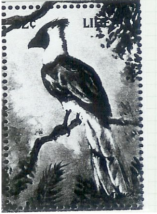
BARE-FACED GO-AWAY-BIRD , Corythaixoides personatus Musophagidae (075.019) Liberia, 1998, 1350h, 32 cents

Length: 19 inches, sexes alike, resident. Smoky-gray above and pale sage-green below with a white neck and a bare dark-brown face.