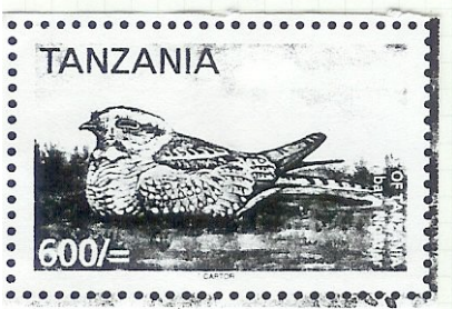
ABYSSINIAN NIGHTJAR , Caprimulgus poliocephalus Caprimulgidae (083.064) Tanzania, 2006, not yet cataloged, 600 shillings

Reference: Sinclair, I. and P. Ryan. Birds of Africa South of the Sahara.