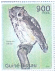
BALSAS SCREECH OWL, Megascops seductus Strigidae Guinea-Bissau, 2010, not yet cataloged, 900f

Length: 10 inches, sexes alike, resident. Brown above and whitish below with brown eyes and a greenish bill.