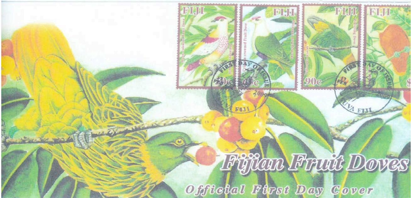
GOLDEN DOVE, Ptilinopus luteovirens Columbidae Fiji, 2009, 1210-1213 First Day Cover