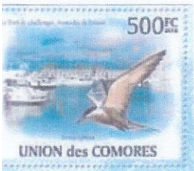
WHITE-CHEEKED TERN, Sterna repressa Laridae Comoro Islands, 2010, not yet cataloged, 500f

Reference: del Hoyo, J., A. Elliott and J. Sargatal, Eds. Handbook of the Birds of the World, Volume 3.