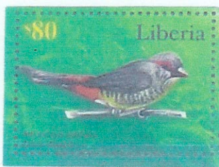
RED-FACED CISTICOLA, Cisticola erythrops Cisticolidae Liberia, 2011, not yet cataloged, $80