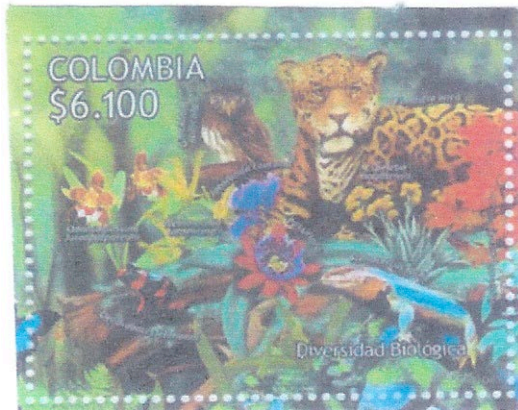
CLOUD-FOREST PYGMY OWL, Glaucidium nubicola Strigidae

Colombia, 2011, not yet cataloged, 6100p