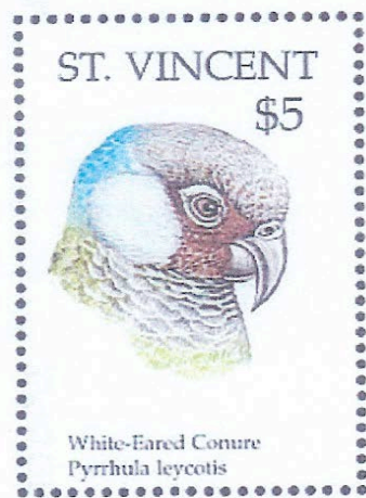
WHITE-EARED CONURE Weight: 2.3oz (65g) Length: 8½in (21cm)