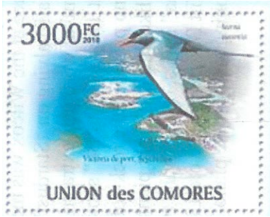
RIVER TERN, Sterna aurantia Laridae Comoro Islands, 2010, not yet cataloged, 3000f

Length: 15 to 18 inches, sexes alike, resident. Dark gray above and white below with a black crown, bright yellow bill, red legs and a deeply forked tail.