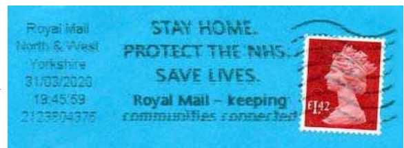
Royal Mail slogan cancel

* NO SPIRITS, NOR VODKA, serve. The strongest vodka is 40% alcohol, and you need 65%.