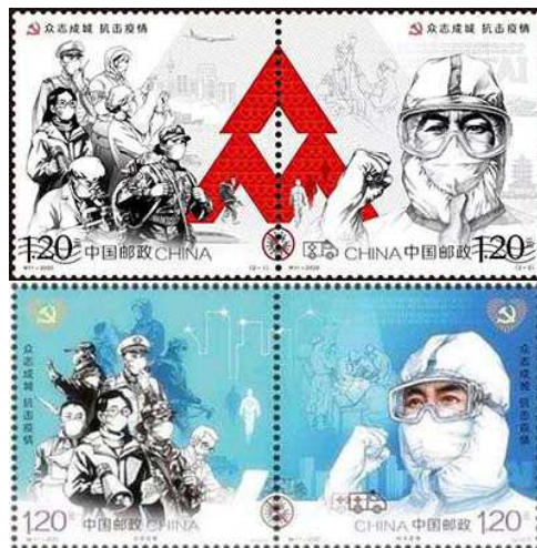
China planned to issue two pairs of stamps on 7 April, 2020, now postponed indefinitely.

Other countries seem to have learned from the SARS (Severe Acute Respiratory Syndrome) epidemic in 2003. Countries that were hit hard by SARS, like Viet Nam and Taiwan, seem to be faring much better in their response to COVID-19. These countries have fewer cases and lower mortality than other countries. Viet Nam's stamps feature hospital workers on one