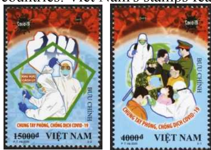
Viet Nam issued a pair of stamps 31 March 2020

In Europe, Italy and Spain have had the highest number of cases of COVID-19. It is not clear why these nations were affected so severely. Infections and deaths have been very high. Spain has issued stamps thanking the health care workers.