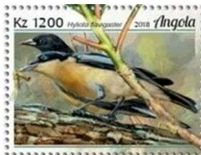
YELLOW-BELLIED HYLIA, Hylia flavigaster Hyltiotidae Angola, 2018 December 10, not yet cataloged, 1200k SS