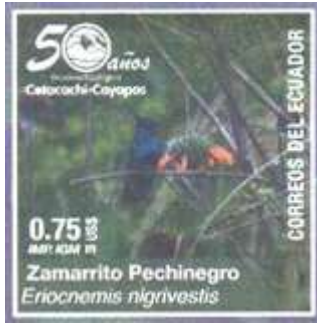
BLACK-BREASTED PUFFLEG, Eriocnemis nigrivestis Trochilidae Ecuador, 2018 December 27, not yet cataloged, 75c

Length: 4 inches, resident. The male (shown) is blackish with a violet-blue throat patch. The female is bronze green above and golden green below with a light blue gular patch.