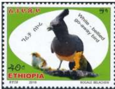
WHITE-BELLIED GO-AWAY-BIRD, Corythaixoides leucogaster Musophagidae Ethiopia, 2018, not yet cataloged, 40c