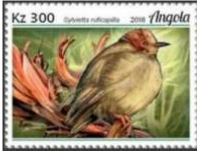
RED-CAPPED CROMBEC, Sylvietta ruficapilla Macrosphenidae Angola, 2018 December 10, not yet cataloged, 340k