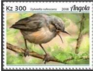
CAPE CROMBEC, Sylvietta rufescens Macrosphenidae Angola, 2018 December 10, not yet cataloged, 340k

Length: 4 inches, sexes alike resident. Grayish above and pale cinnamon below with a pale superciliary.