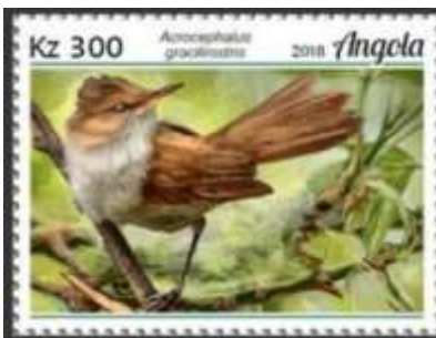
LESSER SWAMP-WARBLER, Acrocephalus gracilirostris Acrocephalidae Angola, 2018 December 10, not yet cataloged, 340k