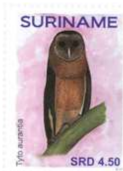
GOLDEN MASKED-OWL, Tyto aurantia Tytonidae Surinam, 2019 April 10, not yet cataloged, $4.50

Length: 11 to 13 inches, sexes similar, resident. Blackish-brown mottled golden-buff above. Paler below. Habitat: Rainforest. Range: New Britain. Reference: del Hoyo, J., A. Elliott, and J. Sargatal, Eds. Handbook of the Birds of the World, Volume 5.