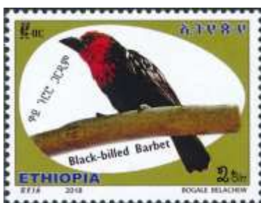
BLACK-BILLED BARBET, Lybius guifsobalito Lybiidae Ethiopia, 2018, not yet cataloged, 2b