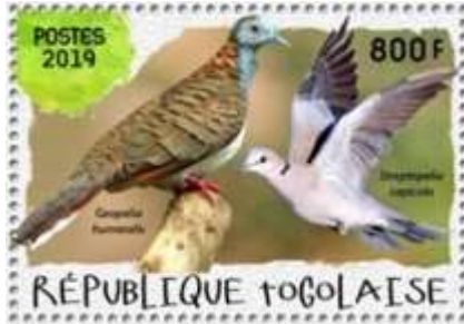
BAR-SHOULDERED DOVE, Geopelia humeralis Columbidae Togo, 2019 February 25, not yet cataloged, 800fr