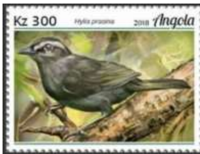
GREEN HYLIA, Hylia prasina Macrosphenidae Angola. 2018 December 10, not yet cataloged, 340k