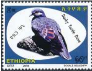
DUSKY TURTLE-DOVE, Streptopelia lugens Columbidae Ethiopia, 2018, not yet cataloged, 60c

Length: 11 inches, sexes alike, resident. Dark brownish gray above and bluish gray head and below with black neck patches. Habitat: Montane forest. Range: Southeastern Sudan to Yemen and northern Malawi. Reference: del Hoyo, J., A. Elliott, and J. Sargatal, Eds. Handbook of the Birds of the World, Volume 4.