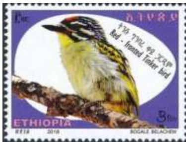
RED-FRONTED TINKERBIRD, Pogoniulus pusillus Lybiidae Ethiopia, 2018, not yet cataloged, 3b