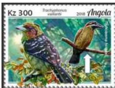
HAIRY-BREASTED BARBET, Tricholaema hirsuta Lybiidae Angola, 2018 December 10, not yet cataloged, 300k