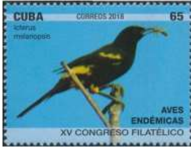
CUBAN ORIOLE, Icterus melanopsis Icteridae Cuba, 2018 November 4, not yet cataloged, 65c

Length: 8 inches, sexes similar, resident. Black with yellow rump, thighs, and shoulders.