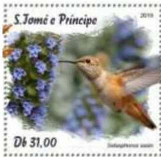
SCINTILLANT HUMMINGBIRD, Selasphorus scintilla Trochilidae St Thomas and Prince Islands, 2019, not yet cataloged, 31d