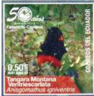
SCARLET-BELLIED MOUNTAIN-TANAGER, Anisognathus igniventris