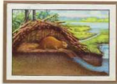
Nestlé "Animal Habitats" card

But in their spare time they enjoy music.