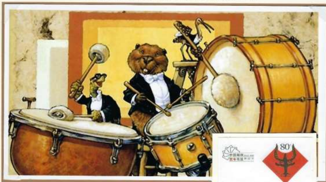
Postal card issued by China Post, 2009

Other beavers prefer playing in a band or orchestra, and their favorite is playing a woodwind instrument or drums.