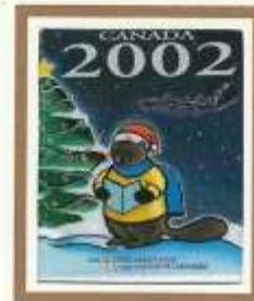
2002 Canadian Christmas Seals

Some beavers especially enjoy singing, and one of their favorite times of the year is Christmas, when they can sing carols, especially "O, Christmas tree" (they love trees).