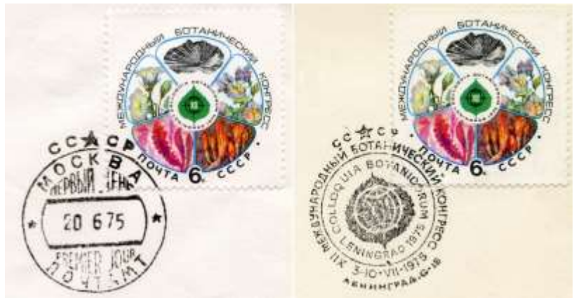
Fig. 16. Postmarks used on the 12th International Botanical Congress stamp. Left, first day of issue 20 June 1975. Right, Congress mail 3–10 August 1975.