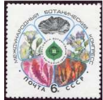
Fig. 14. Stamp issued for the 12th International Botanical Congress, Leningrad.

The congress symbol is itself surrounded by five sectors showing different images of Russian flora, and the text “XII International Botanical Congress · Post · USSR” in Cyrillic.