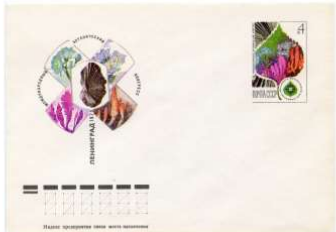
Fig. 15. Pre-stamped postcard and envelope produced for the 12th International Botanical Congress.

A special postmark showing the Congress symbol and dated 3–10.VIII.1975 was used throughout the Congress (Fig. 16).