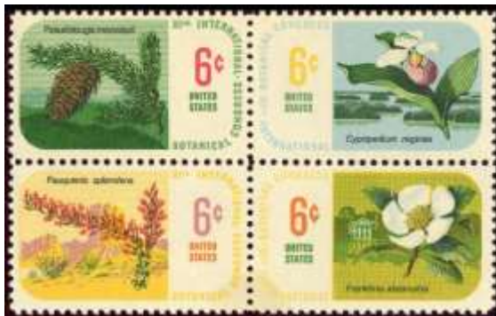
Fig. 11. Set of stamps for the 11th International Botanical Congress in Seattle.

The set-tenant stamps show Douglas Fir [ Pseudotsuga menziesii (Mirb.) Franco] from the northwest, Ocotillo ( Fouquieria splendens Engelm.) from the southwest, Showy Lady's Slipper ( Cypripedium reginae Walter) from the northeast, and Franklin tree ( Franklinia alatamaha W. Bartram ex Marshall) from the southeast (Fig. 11). Franklinia alatamaha is unfortunately now extinct in the wild, but it survives as a cultivated ornamental tree.