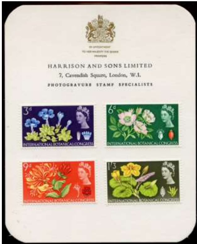
Fig. 10. Set of stamps for the 10th International Botanical Congress on the printers, Harrison & Sons, presentation card. Insert, official Congress handstamp from 31 July 1964.