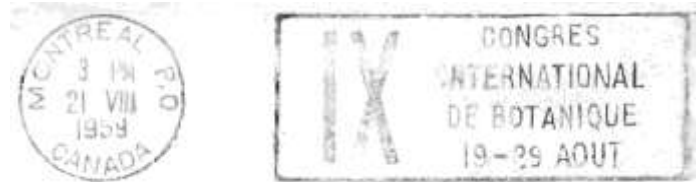
Fig. 8. Slogan postmark from the 9th International Botanical Congress, Montreal, in French.

The Congress Organizing Committee used printed envelopes with the Congress emblem, a green and white maple leaf with “1959” in green, located in the center of the name of the Congress in English and French. A cover used in 1957 as part of the organization of the Congress is shown in Fig. 9.