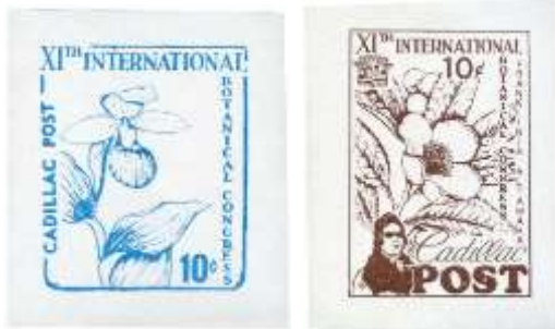
Fig. 13. Cadillac Post stamps for the 11th International Botanical Congress.

The 12th International Botanical Congress was held in the Komarov Botanical Institute, Leningrad (now St Petersburg), USSR on 3–10 July 1975, and a special stamp, designed by Leo Sharov, was issued on 20 June 1975 (Fig. 13).