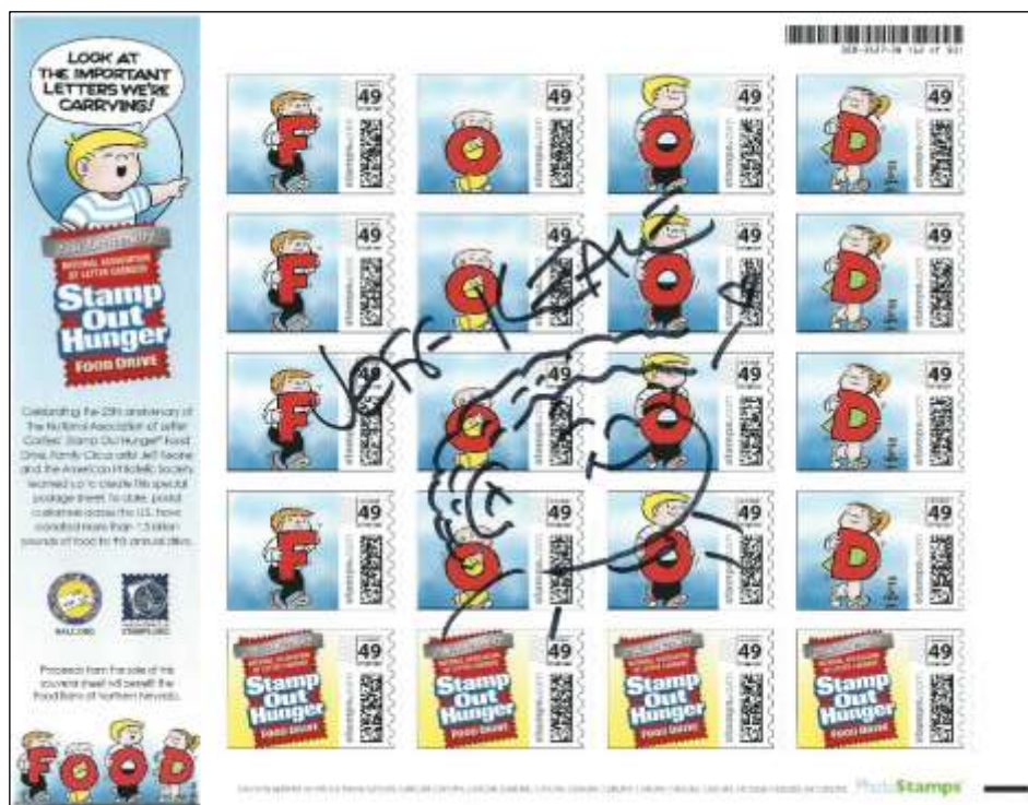
Personalized postage souvenir sheet with Family Circus images Autographed by artist Jeff Keane

A vintage 1929 Ford mail truck was on display by the NALC booth courtesy of the National Automobile Museum—The Harrah Collection.