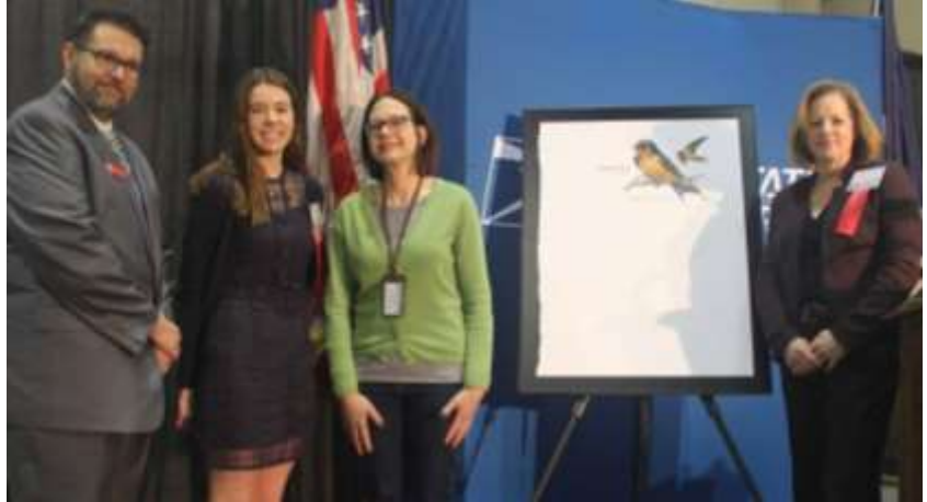
Barn Swallow First Day Ceremony

An added first day ceremony took place on Saturday for another biologically themed issue when the Marshall Islands released a miniature sheet of ten 49-cent Flora stamps [see Biophilately , Vol. 66(1), p.63].