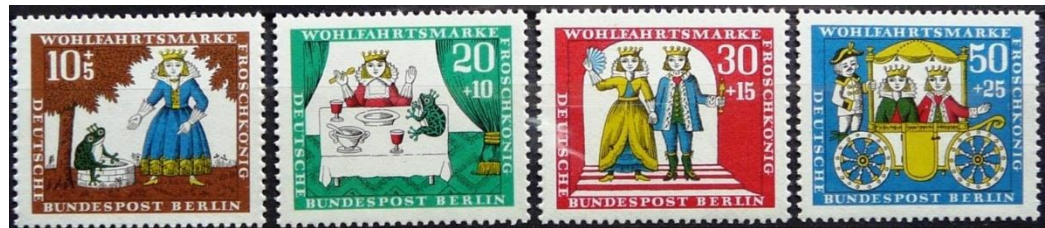
The Princess and the Frog , Germany-Berlin, 1966, Sc#9NB41–44

The Princess and the Frog fairy tale (Sc#418–21). They used the same designs on stamps from Berlin.