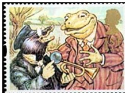
Great Britain, 1993, Sc#1482

No doubt that the frog with greatest public appeal for children—and adults as well—is Kermit the frog who first appeared on the Children's Television Network program Sesame Street . Kermit went on to star in television specials, movies, and books, and was even selected as the Grand Marshal of the Pasadena, California, Rose Bowl Parade in 1996.