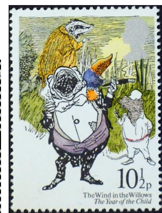
Great Britain, 1979, Sc#868

The popular children's book, The Wind In The Willows , by Kenneth Grahame has brought fame to Mr. Toad, one of four animal friends who share many misadventures. Published in 1908, it has had many stage and television adaptations, and in 1985, a Broadway musical version was nominated for a Tony award.