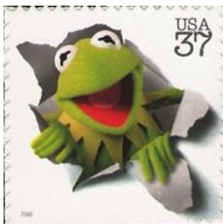
USA, 2005, Sc#3944a

No doubt that the frog with greatest public appeal for children—and adults as well—is Kermit the frog who first appeared on the Children's Television Network program Sesame Street . Kermit went on to star in television specials, movies, and books, and was even selected as the Grand Marshal of the Pasadena, California, Rose Bowl Parade in 1996.