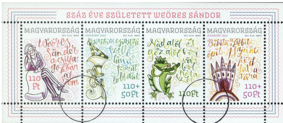
Hungary, 2013, Sc#4288c

Sandor Weores (1913–1989) was a Hungarian author and perhaps the country's greatest poet. In honor of his creative writing, Hungary published this miniature sheet of four stamps, the third of which illustrates a frog from one of his creations.