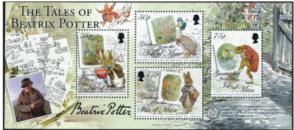
Isle of Man, 2006, Sc#1171d (at right)

Rafael Pombo (1833–1912) was a journalist and translator who was given the honor of being named Colombia's most outstanding poet. Pombo created Rin Rin, a tadpole who fails to listen to his elders, much like a young person might. It has been written that Rin Rin is one of the most universally known characters from children's stories known throughout the country of Colombia.