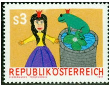
Austria, 1981, Sc#1181