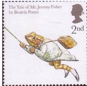
Great Britain, 2006, Sc#2334

The Tale of Mr. Jeremy Fisher , written and illustrated by Beatrix Potter, tells of adventures of a frog named Jeremy Fisher. It followed Ms. Potter's publication of The Tale of Peter Rabbit and has retained its popularity since being published in 1906.