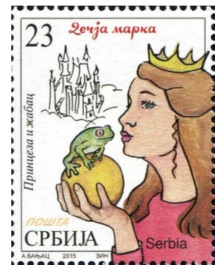
Serbia, 2016, Sc#717a