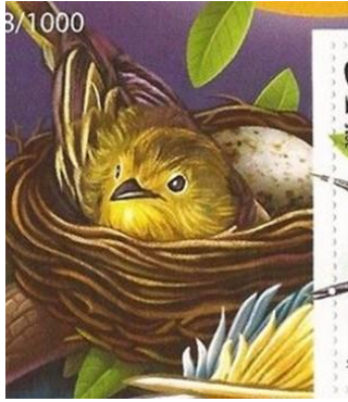
ELFIN WOODS WARBLER, Setophaga angelae Parulidae Sierra Leone, 2015 October 23, not yet cataloged, MS/4 LL Margin

Length: 5 inches, sexes alike, resident. Black above and black-streaked white below with white wing-bars and a broken white eye-ring.