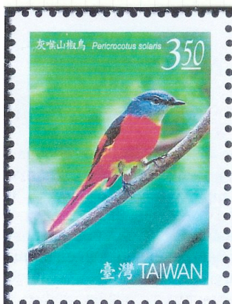
GRAY-CHINNED MINIVET , Pericrocotus solaris Campephagidae (123.080)