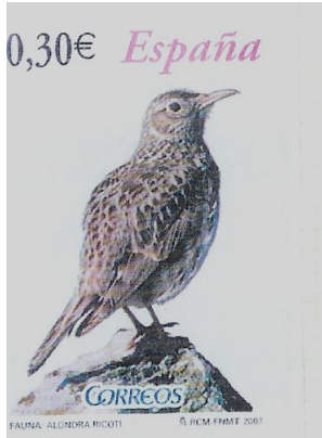
DUPONT'S LARK , Chersophilus duponti Alaudidae (120.051) Spain, 2007, not yet cataloged, 0.30 euro

Length: 7 inches, sexes similar, resident. Rufous brown above and whiteish belly with a streaked breast and neck and a long curved bill.