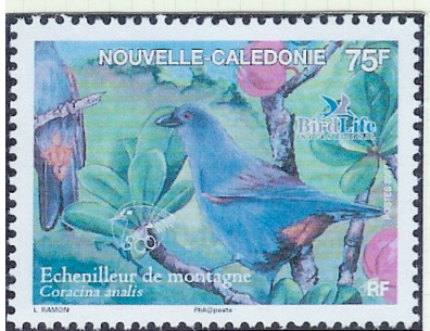
NEW CALEDONIAN CUCKOO-SHRIKE , Coracina analis Campephagidae (123.022)