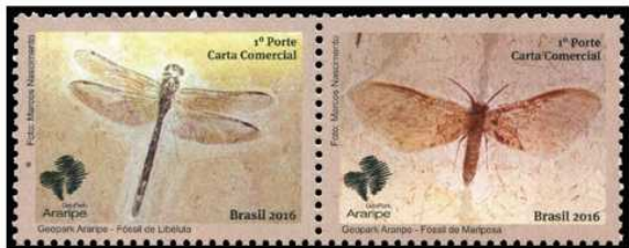
Carbon films of insects Brazil, 2016, SC 3349a and b