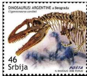
Apatite Replacement and Recrystallization, Gigantosaurus Serbia, 2009 SC 489