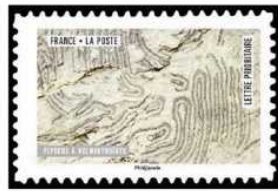
Helminthoides burrows France, 2018 SC 5365