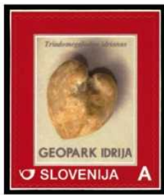
Internal Mold, Bivalve Slovenia, 2014, Local Issue