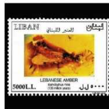
Fossil Insect in Amber Lebanon, 2003, SC 570