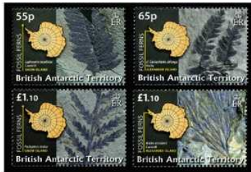
Carbon films of ferns British Antarctic Territory 2008, SC 401-404