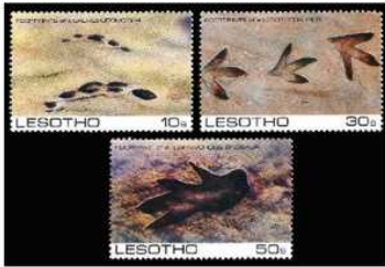
Theropod dinosaur footprints, Lesotho, 1984, SC 445-447

compression. In addition, one mechanism preserves the shape of the organism but not the actual remains – casts and molds. Each mechanism will briefly be described below with examples of stamps that illustrate the mechanism (Figure 2). In all cases, burial is key to fossilization – as quickly burying an