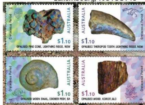
Opalized fossils - Replacement with Opal Australia, 2020, SC - Not Available Yet