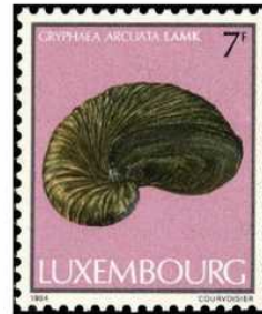
Recrystallized Gryphea (Oyster) Luxembourg, 1984 SC 715