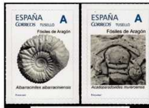
External Casts of Ammonoid and Trilobite head, Local Issues, Spain, 2019