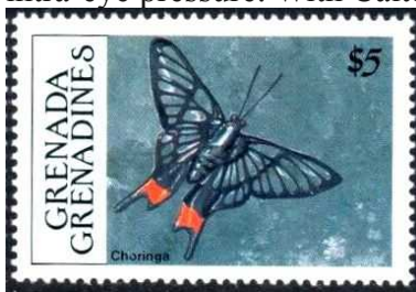
Figure 5 – Stamp of Grenada-Grenadines 1991, Scott #1285, with butterfly Chorinea faunus

solve issues involved in screen glare. The team seeks to develop a perfect anti-glare display for laptops, smartphones, and other devices. This, however, is not the only biomimetic study that glasswing butterflies have inspired. The most recent development in glasswing butterfly biomimicry comes from the California Institute of Technology. Engineers took the antireflective property of the wings of longtail glasswing butterflies with scientific name Chorinea faunus (Figure 5) as a model to develop an ultrathin eye implant to monitor intra-eye pressure. With Caltech’s biophotonic eye implant, which comes with a