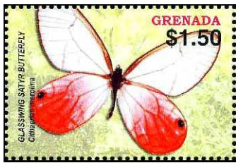
Figure 9 – Stamp of Grenada 2005, Scott #3491c, with butterfly Cithaerias merolina

One special species of glasswing butterfly Cithaerias merolina out there has a special “blush” look to it (Figure 9). The pink glasswing butterfly – which can be found in the Amazon region – has clear wings at the top, which turn pinkish towards the bottom, making for a butterfly with matching blushing wings. A stunning clearwing butterfly from the undergrowth of a rainforest. Clear wings transition into pink at the tip of the hindwing. A small eyespot is found in the pink shading.