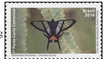
Figure 6 – Stamp of Brazil 2016, Scott #3347o, with butterfly Chorinea licursis

about 30–35 millimetres. These butterflies are quite variable with respect to the size of the transparent region and of spots on the hindwings. They have transparent wings outlined with black and long tails on the hindwings. Forewings and hindwings are crossed by black veins and by two black transverse bands. At the base of the hindwing tails there are bright red marks.