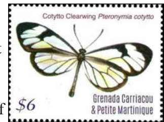
Figure 4 - Stamp of Grenada-Grenadines 2019 with glasswing butterfly Pteronymia cotyttot

The look of these beautiful glasswing butterflies fluttering their transparent wings has brought inspiration to engineers studying biomimetics, especially in optics. In the case of glasswing butterflies, scientists focus on the irregular nanostructure of their wings which gives them this ability to let light pass through (Figure 4). For example, German engineers from the Karlsruhe Institute of Technology have been studying glasswing butterflies to