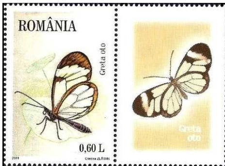
Figure 2 – Stamp of Romania 2011, Scott #5249, with tab and butterfly Greta oto

The butterfly with scientific name Greta oto (Figure 2) is known by the common name glasswing butterfly for its unique transparent wings that allow it to camouflage without