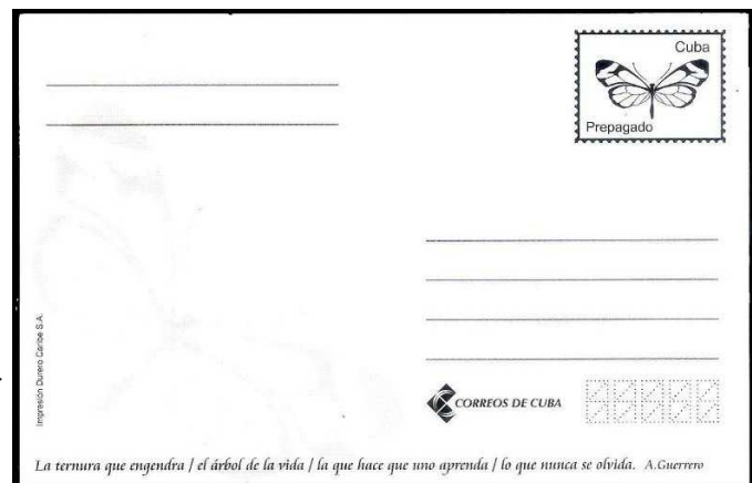
Figure 12 – Stationery card of Cuba 2012 with glasswing butterfly Greta cubana