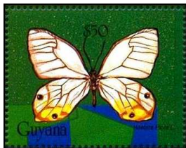
Figure 11 – Stamp of Guyana 1994, Scott #2827d, with butterfly Haetera piera

Glasswing butterflies are widespread throughout much of Central America and South America inhabiting the lowland rain forests. One such stunning butterfly species is Haetera piera .