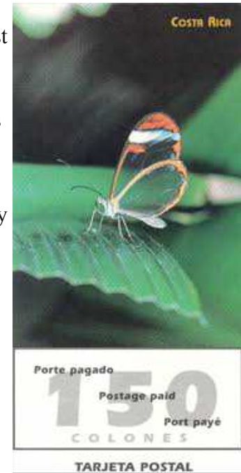
Figure 1 – Stationery card of Costa Rica 1999 with glasswing butterfly Greta oto

The clear tissue that makes up the wings (Figure 3) does not contain the colour-producing scales present in most butterfly wings. As a result, the tissue does not absorb or scatter much light, instead letting most of it pass through. Not much light is reflected, either, due to microscopic structures on the surface called 'nanopillars'. The nanopillars have a random distribution of sizes and positions, which means that there is a gradual transition between the refractive index of the wing and that of the surrounding air. This