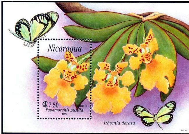
Figure 3 – Souvenir sheet of Nicaragua 1991, Scott #1870, with glasswing butterfly Ithomia derasa

solve issues involved in screen glare. The team seeks to develop a perfect anti-glare display for laptops, smartphones, and other devices. This, however, is not the only biomimetic study that glasswing butterflies have inspired. The most recent development in glasswing butterfly biomimicry comes from the California Institute of Technology. Engineers took the antireflective property of the wings of longtail glasswing butterflies with scientific name Chorinea faunus (Figure 5) as a model to develop an ultrathin eye implant to monitor intra-eye pressure. With Caltech’s biophotonic eye implant, which comes with a