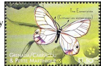
Figure 10 – Stamp of Grenada-Grenadines 2000, Scott #2195d, with butterfly Cithaerias esmeralda

One of the greatest treasures of tropical forest in South America is Cithaerias esmeralda , a butterfly whose wings are transparent except for a bright violet patch on the hind wing (Figure 10). This