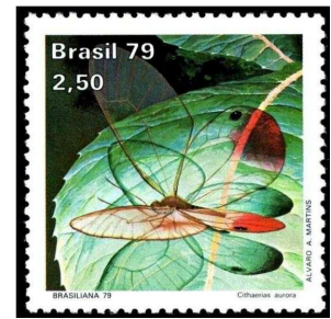
Figure 8 – Stamp of Brazil 1979, Scott #1620, with butterfly Cithaerias aurora

One of the greatest treasures of tropical forest in South America is Cithaerias esmeralda , a butterfly whose wings are transparent except for a bright violet patch on the hind wing (Figure 10). This