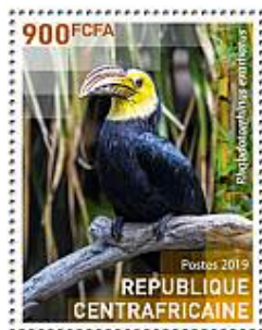
SULAWESI HORNBILL , Penelopides exarhatus Bucerotidae Central African Republic, 2019, not yet cataloged, 900fr

Length: 18 inches, resident. The male (shown on the stamp) is black with a white or yellow face and throat; the female is all black.