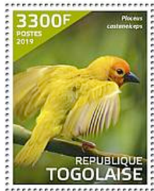
TAVETA GOLDEN WEAVER, Ploceus castaneiceps Ploceidae Togo, 2019, not yet cataloged, 3300fr

Length: 6 inches, resident. The male (shown on the stamp) is olive-yellow above and golden-yellow below with a yellow-orange crown and a chestnut-orange collar; the female is greenish above and off-white below, with a pale yellow breast.