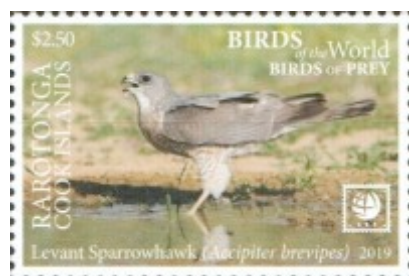
LEVANT SPARROWHAWK, Accipiter brevipes Accipitridae Rarotonga-Cook Island, 2018, 1645, $2.50

Length: 13 to 15 inches, migratory. The male (shown on the stamp) is dull blue-gray above and reddish-barred pale below; the female is brownish-gray above and heavily barred pale below.