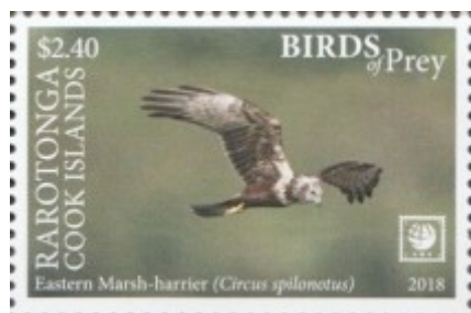
EASTERN MARSH-HARRIER, Circus spilonotus Accipitridae Rarotonga-Cook Island, 2019, 1621, $2.50

Length: 19 to 22 inches, migratory. The male (shown on the stamp) is blackish above and black-streaked white below with a streaked white collar; the female is brown with dark streaking on the crown and nape.