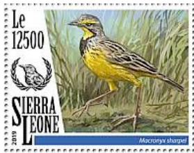
SHARPE'S LONGCLAW, Hemimacronyx sharpei Motacillidae Sierra Leone, 2019, not yet cataloged, 12500Le

Length: 7 inches, resident. The male (shown on the stamp) is scaly olive-brown above and deep lemon-yellow below with brownish-black streaks on the breast and a lemon-yellow supercilium; the female is pale yellow below and has a white supercilium.