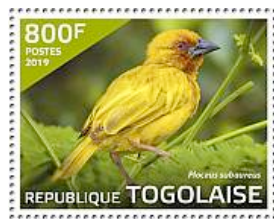
AFRICAN GOLDEN WEAVER, Ploceus subaureus Ploceidae Togo, 2019, not yet cataloged, 800fr

Length: 6 inches, resident. The male (shown on the stamp) is greenish yellow above and yellow below with a red iris; the female has a greenish crown and a dark brown iris.