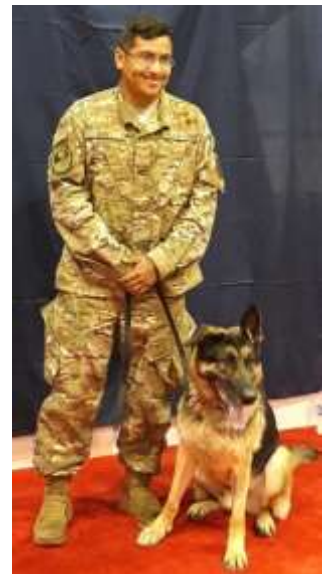
MWD Morty & handler

As I watched the many photos being taken of Morty and his handler, I jokingly mentioned to the non-commissioned officer-in-charge that Morty was really famous now and would never be able to work undercover again. The sergeant laughed and told me that Morty, who sports a floppy ear, had just returned from a deployment in the Middle East and that everyone there knew all about the dog with the "floppy ear."