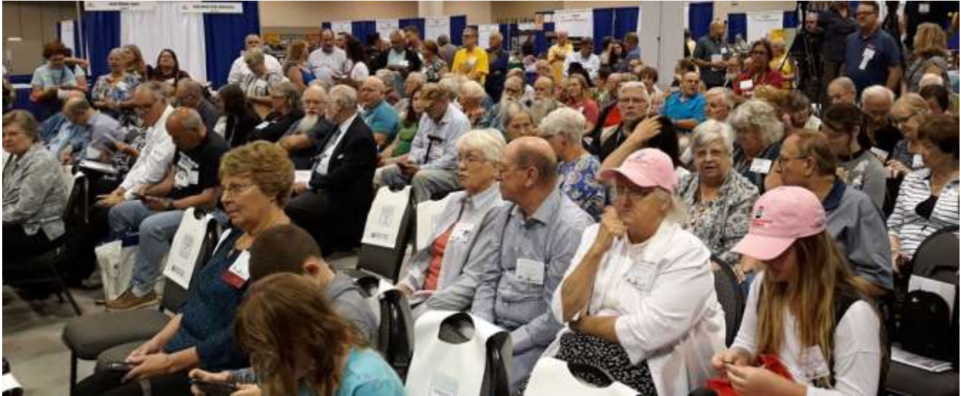
A large crowd assembled for the Military Working Dog first day ceremony. Many more arrived after this photo was taken.

For the second year in a row, the American Topical Association (ATA) partnered with the American Philatelic Society (APS) to host a joint stamp show. The APS and ATA are the two largest philatelic organizations in the United States. Each organization has traditionally held an annual national-level stamp show: APS StampShow and ATA National Topical Stamp Show (NTSS). These shows are held in different cities around the country each year.