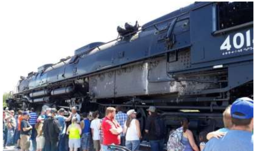
Union Pacific No. 4014 "Big Boy"