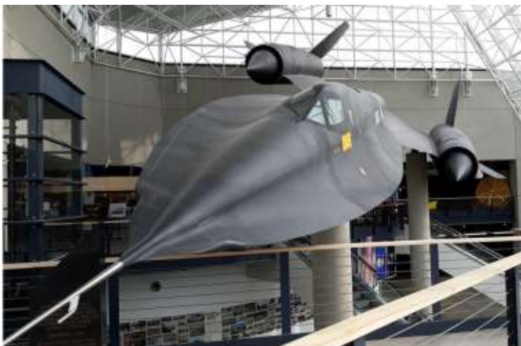
SR-71 at SAC Museum