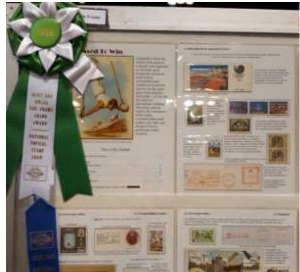
Mary Anne Owens One Frame Grand Award

The APS StampShow is the venue for the World Series Multi-frame Champion of Champions Award. This year there were 30 competitors entered, the Grand Award winners from each of the WSP shows since the last C-of-C in 2018.