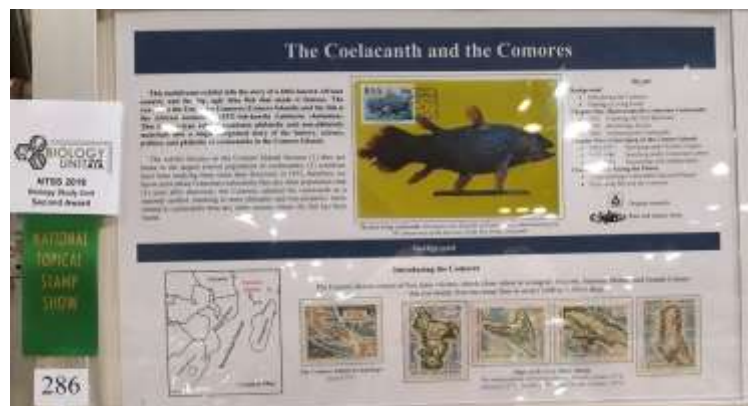
Biology Unit 2nd Award