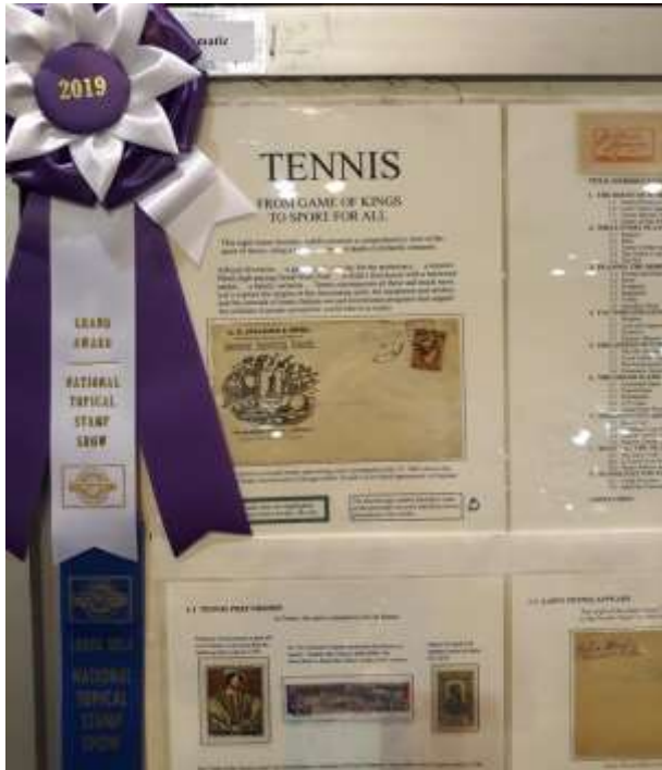
NTSS Grand Award