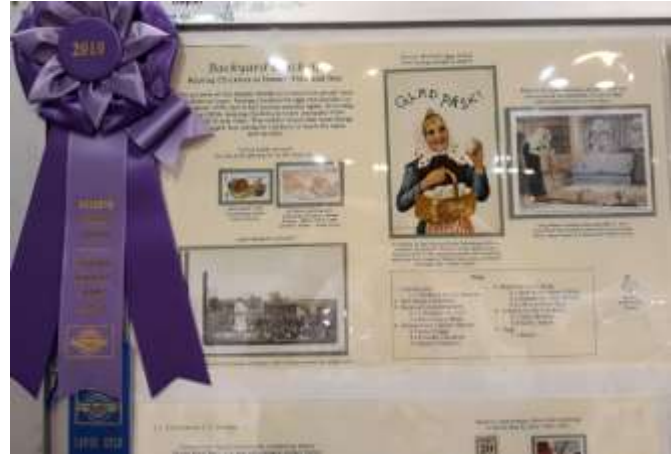
NTSS Reserve Grand Award