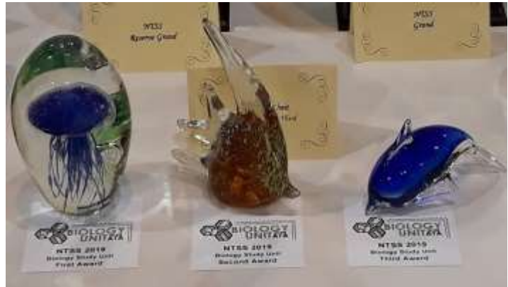
Biology Unit 1st, 2nd, and 3rd Awards