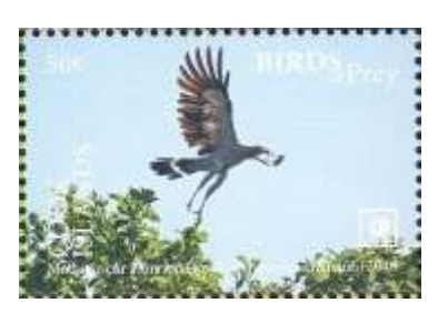
the World, Volume 2.