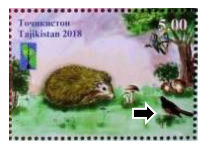
of the World, Volume 10.

WHITE-CAPPED REDSTART, Phoenicurus leucocephalus Muscicapidae Tajikistan, 2918 December, not yet cataloged, 5s