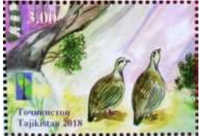
of the World, Volume 2.