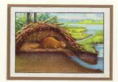
Nestlé "Animal Habitats" card

But in their spare time they enjoy music.