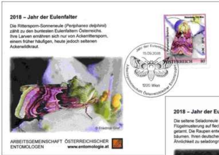
Periphanes delphinii Philateliemarke stamp on envelope

On 15 September 2018, Austria Post issued a pair of stamps depicting two species of moths from the Noctuidae family and celebrating 2018 as the “Year of the Noctuidae.” The first day ceremony was held at the Hirschstetten Botanical Gardens in Vienna, Austria. Issued at the same time were two C6 envelopes with cachets and two A6 size postcards that show each moth in a natural setting.