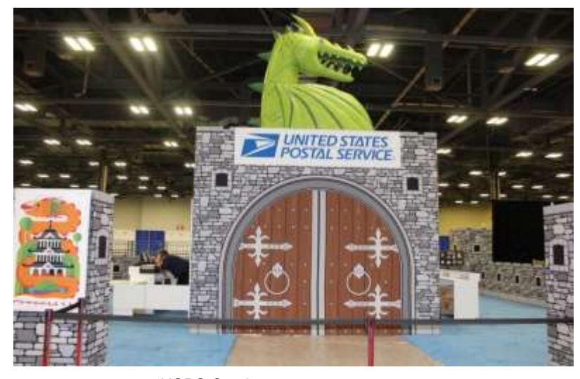
USPS Castle

On Thursday, at the APS-NTSS, they held a first day ceremony to issue a pane of 16 stamps with four different designs depicting stylized dragons. The APS and ATA used the