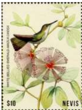
WHITE-BELLIED EMERALD, Amazilia candida Trochilidae Nevis, 2018 June 5, not yet cataloged, $10 SS