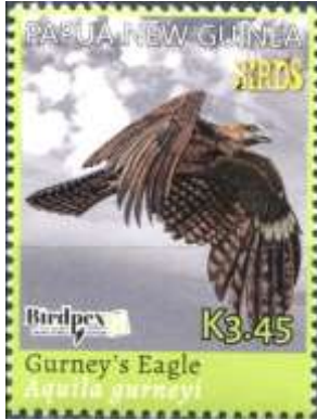
GURNEY'S EAGLE, Aquila gurneyi Accipitridae Papua New Guinea, 2018 May 31, not yet cataloged, 3.45 k

Length: 27 to 32 inches, sexes alike, resident. Black with yellow feet. Habitat: Primary rain forest, swamp forest, and adjacent areas. Range: Moluccas to New Guinea, Reference: del Hoyo, J., A. Elliott, and J. Sargatal, Eds. Handbook of the Birds of the World, Volume 2 .