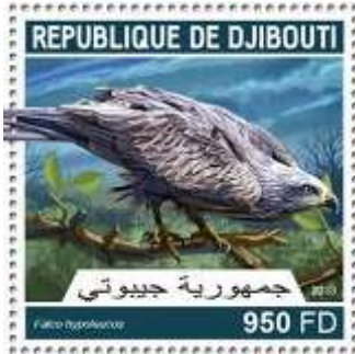
GRAY FALCON, Falco hypoleucos Falconidae Djibouti, 2018 March 15, not yet cataloged, 950fr SS