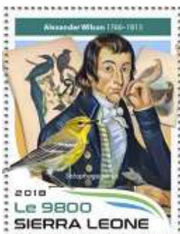
PINE WARBLER, Setophaga pinus Parulidae Sierra Leone, 2018 April 27, not yet cataloged, 9800le