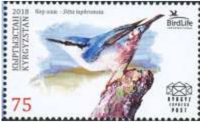
PERSIAN NUTHATCH, Sitta tephronota Sittidae Kazakhstan, 2018 May 22, not yet cataloged, 75s

Length: 6 inches, sexes alike, resident. Medium gray above and creamy white below with a pinkish-buff belly and long black eye-stripe.