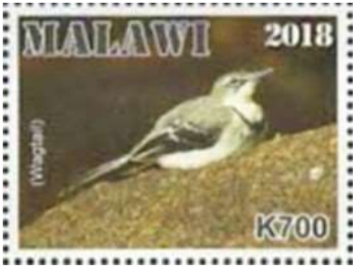
MOUNTAIN WAGTAIL, Motacilla clara Motacillidae Malawi, 2018 June 4, not yet cataloged, 700k

Length: 6 to 8 inches, sexes alike, resident. Gray above and white below with a black necklace and white superciliary and outer tail.