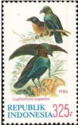
VOGELKOP SUPERB BIRD-OF-PARADISE, Lophorina niedda Paradisaeidae Indonesia, 1984 October 15, Sc#1245, 325r

Length: 10 inches, resident. The male (shown) is velvety jet black above and metallic greenish-blue below with a black head and throat. The female is blackish brown above and finely barred ochraceous below with a finely spotted white stripe behind the eyes.