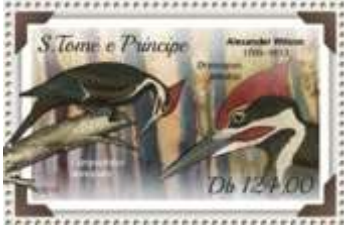
PILEATED WOODPECKER, Dryocopus pileatus Picidae St. Thomas & Prince Islands, 2018 May 19, not yet cataloged, 124d SS

Length: 16 to 19 inches, resident. The male (shown) is black with a white face, neck, and throat and red crest and malar. The female has a black malar.