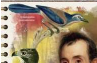
FLORIDA SCRUB-JAY, Aphelocoma coerulescens Corvidae St. Thomas & Prince Islands, 2018 May 19, 124d SS (UR margin)