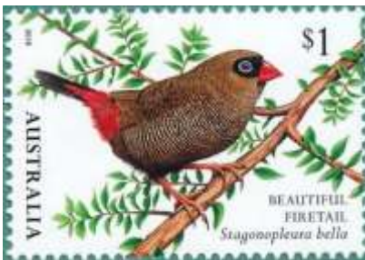
BEAUTIFUL FIRETAIL, Stagonopleura bella Estrildidae Australia, 2018 June 5, not yet cataloged, $1