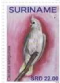
LITTLE CORELLA, Cacatua sanguinea Cacatuidae Surinam, 2018 July 18, not yet cataloged, $22