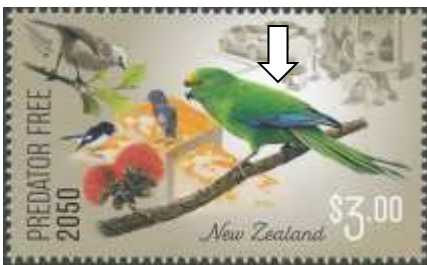
CHATHAM ISLANDS PARAKEET, Cyanoramphus forbesi Psittaculidae