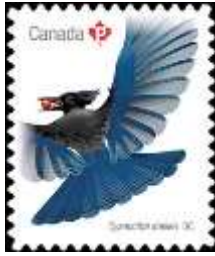
STELLER'S JAY, Cyanocitta stelleri Corvidae Canada, 2018 August 20, not yet cataloged, 85c

Length: 12 to 14 inches, sexes similar, resident. Blue, with a bluish-black crested head.