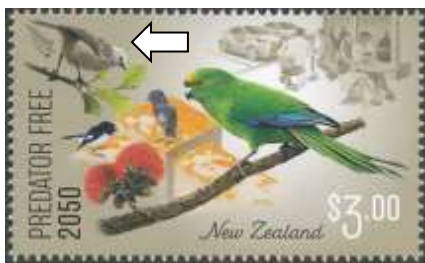
WHITEHEAD, Mohoua albicilla Mohouidae New Zealand, 2018 August 1, not yet cataloged, $3