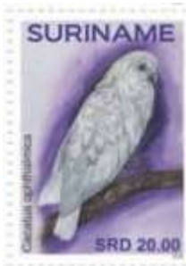
BLUE-EYED COCKATOO. Cacatua ophthalmica Cacatuidae Surinam, 2018 July 18, not yet cataloged, $20