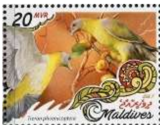
YELLOW-FOOTED PIGEON, Treron phoenicoptera Columbidae Maldive Islands, 2017 March 16 not yet cataloged, 20r

Length: 13 inches, sexes similar, resident. Yellowish green above and bluish gray head and below with a mustard-yellow neck and breast. Habitat: Forest, scrub, parks, and gardens. Range: Eastern Pakistan and extreme south-central China to Sri Lanka and southern Vietnam.