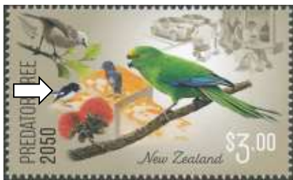
TOMTIT, Petroica macrocephala Petroicidae New Zealand, 2018 August 1, not yet cataloged, $3