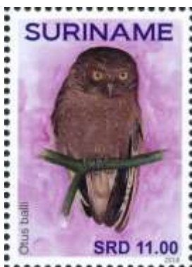
ANDAMAN SCOPS-OWL, Otus balli Strigidae Surinam, 2018 January 3, not yet cataloged, $11