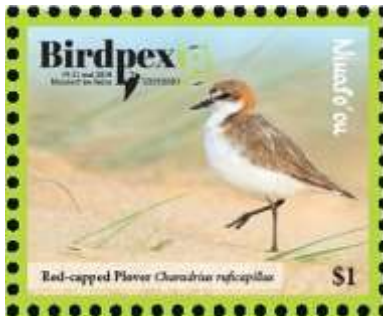
RED-CAPPED PLOVER, Charadrius ruficapilla Charadriidae Tonga (Niufo'ou), 2018, not yet cataloged, $1

Length: 6 inches, sexes similar, resident. Brown above and white below with a red cap, white forehead and supercilium, and dark neck patch.