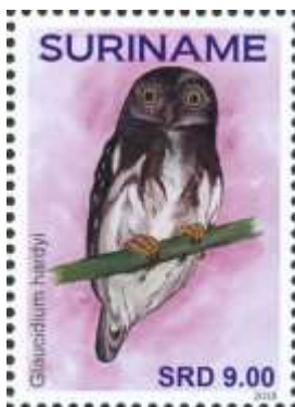
AMAZONIAN PYGMY-OWL, Glaucidium hardyi Strigidae Surinam, 2018 January 3, not yet cataloged, $9