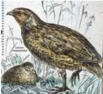
NEW ZEALAND QUAIL, Coturnix novaezelandiae Phasianidae Central African Republic, 2016 November 21, not yet cataloged (Mi#6554), SS 2650fr (UR margin)

Reference: del Hoyo, J., A. Elliott, and J. Sargatal, Eds. Handbook of the Birds of the World, Volume 3 .