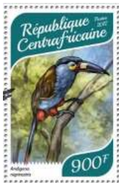
BLACK-BILLED MOUNTAIN-TOUCAN , Andigena nigricollis Ramphastidae Central African Republic, 2017 December 20, not yet cataloged (Mi#7486), 900fr