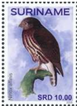
ANDAMAN BOOBOOK , Ninox affinis Strigidae Surinam, 2018 January 3, not yet cataloged, $10