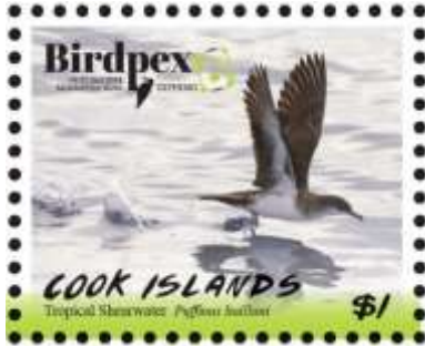
TROPICAL SHEARWATER, Puffinus bailloni Procellariidae Cook Islands, 2018, not yet cataloged, $1

Length: 11 to 13 inches, sexes alike, marine. Brown above and white below with brown edges on the underwings and pink legs.