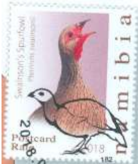
SWAINSON'S FRANCOLIN, Francolinus swainsonii Phasianidae Namibia, 2018 May 18, not yet cataloged, "Postcard Rate"

Length: 13 to 15 inches, sexes similar, but the female is darker and more heavily patterned, resident. Black-streaked brown, paler below with a red face and throat. Habitat: Savanna and bush, near water.