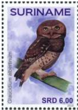
ALBERTINE OWLET , Glaucidium albertinum Strigidae Surinam, 2018 January 3, not yet cataloged, $6

Length: 8 inches, sexes alike, resident. Maroon-brown above and maroon-brown spotted white below with a barred upper chest and a cream-spotted head.