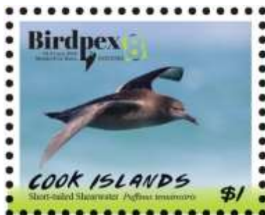
SHORT-TAILED SHEARWATER, Puffinus tenuirostris Procellariidae Cook Islands, 2018, not yet cataloged, $1

Reference: del Hoyo, J., A. Elliott, and J. Sargatal, Eds. Handbook of the Birds of the World, Volume 1 .