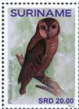
CONGO BAY-OWL, Phodilus prigoginei Tytonidae Surinam, 2018 January 3, not yet cataloged, $20