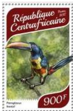
FIERY-BILLED ARACARI , Pteroglossus frantzii Ramphastidae Central African Republic, 2017 December 20, not yet cataloged (Mi#7485), 900fr

Reference: del Hoyo, J., A. Elliott, and J. Sargatal, Eds. Handbook of the Birds of the World, Volume 7 .