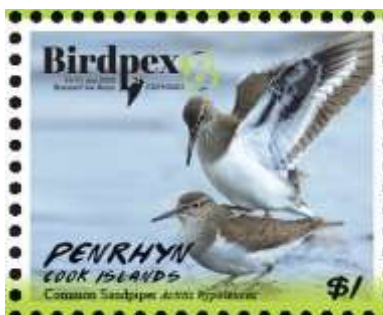
COMMON SANDPIPER, Actitis hypoleucos Scolopacidae Penrhyn, 2018, not yet cataloged, $1