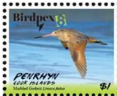
MARBLED GODWIT, Limosa fedoa Scolopacidae Penrhyn, 2018, not yet cataloged, $1