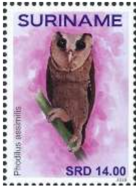
SRI LANKA BAY-OWL, Phodilus assimilis Tytonidae Surinam, 2018 January 3, not yet cataloged, $14

Length: 9 to 13 inches, sexes alike, resident. Dark-brown-speckled chestnut-bay above and black-spotted pinkish-buff below with a squarish pale grayish-pink facial disc.