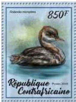
TITICACA GREBE, Rollandia microptera Podicipedidae Central African Republic, 2018 January 16, not yet cataloged (Mi#7582), 850fr

Length: 10 to 14 inches, sexes similar, resident. Gray above and speckled below with a white chin and throat and rufous breast.