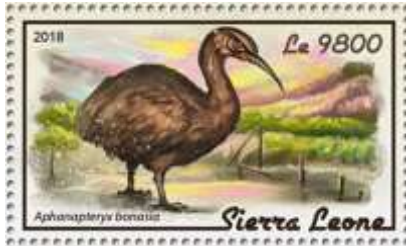
RED RAIL, Aphanapteryx bonasia Rallidae Sierra Leone, 2018 February 27, not yet cataloged, 9800le