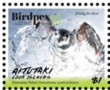
HAWAIIAN PETREL, Pterodroma sandwichensis Procellariidae Aitutaki, 2018, not yet cataloged, $1