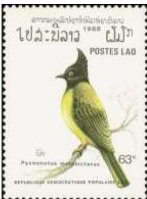
BLACK-CRESTED BULBUL, Pycnonotus flaviventris Pycnonotidae Laos, 1988 September 30, Sc#881. 63k