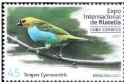
GILT-EDGED TANAGER, Tangara cyanoventris Thraupidae Cuba, 2017, not yet cataloged, 45p

Length: 5 inches, sexes similar, resident, Black-streaked green above and turquoise blue below with a yellow head and black around the bill and eyes, Habitat: Humid forest band forest borders.