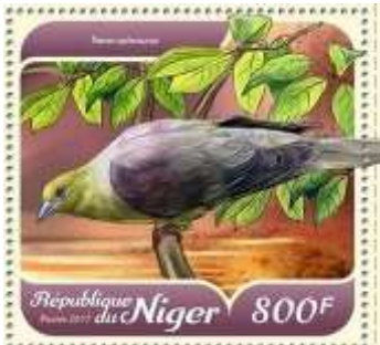
WEDGE-TAILED PIGEON, Treron sphenurus Columbidae Niger, 2017 December 28, not yet cataloged, 800fr