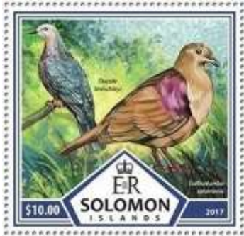
THICK-BILLED GROUND-DOVE, Gallicolumba salamonis Columbidae Solomon Islands, 2017, Sc#2321c, $10 (on R)

Reference: del Hoyo, J., A. Elliott, and J. Sargatal, Eds. Handbook of the Birds of the World, Volume 2.