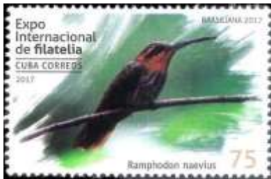
SAW-BILLED HERMIT, Ramphodon naevius Trochilidae Cuba, 2017, not yet cataloged, 75p