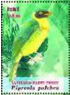
MASKED FRUITEATER, Pipreola pulchra Cotingidae Peru, 2018 January 15, not yet cataloged, 8s

Length: 7 inches, resident. The male (shown) is green above and yellow below with a black hood, orange-yellow breast patch with a black lower border, and green-streaked flanks. The female is green above and streaked green and yellow below.