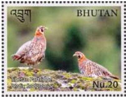
TIBETAN PARTRIDGE, Perdix hodgsoniae Phasianidae Bhutan, 2017 November 30, not yet cataloged, 20nu

Length: 11 inches, sexes alike, resident. Scaly gray above and black-barred white below with a chestnut crown and hindneck, white superciliary and throat, and a black mustache.