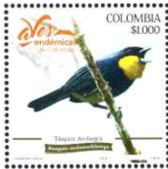
PURPLISH-MANTLED TANAGER, Iridosornis porphyrocephalus Thraupidae