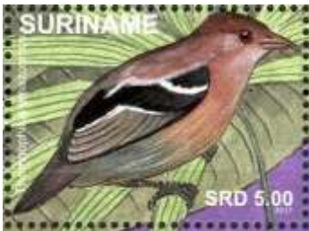
AMAZONIAN ANTSHRIKE, Thamnophilus amazonicus Thamnophilidae Suriname, 2017 December 19, not yet cataloged, $5