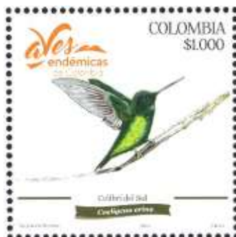
DUSKY STARFRONTLET, Coeligena orina Trochilidae Colombia, 2018 January 23, not yet cataloged, 1000p