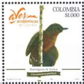
PARKER'S ANTBIRD, Cercomacra parkeri Thamnophilidae Colombia, 2018 January 23, not yet cataloged, 1000p