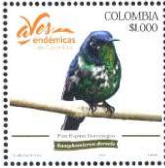
BLACK-BACKED THORNBILL, Ramphomicron dorsale Trochilidae Colombia, 2018 January 23, not yet cataloged, 1000p

Length: 4 inches, resident. The male (shown) is velvety black above and dark gray below with a yellow throat. The female is grass green above and green-spotted white below.