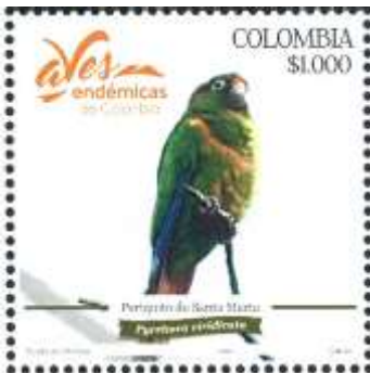
SANTA MARTA PARAKEET, Pyrrhura viridicata Psittacidae Colombia, 2018 January 23, not yet cataloged, 1000p