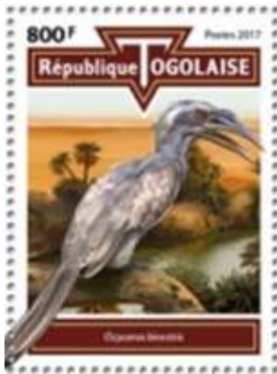
INDIAN GRAY HORNBILL, Ocyrceros birostris Bucerotidae Togo, 2017 December 15, not yet cataloged, 800fr