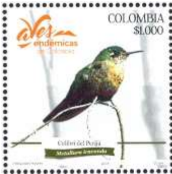
PERIJÁ METALTAIL Metallura iracunda Trochilidae Colombia, 2018 January 23, not yet cataloged, 1000p