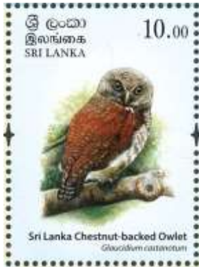
CHESTNUT-BACKED OWLET, Glaucidium castanonotum Strigidae Sri Lanka, 2017 December 16, not yet cataloged, 10r

Length: 8 inches, sexes alike, resident. Black-barred chestnut above and black-barred white below with a barred brown-and-cream head.