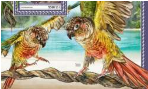
GREEN-CHEEKED PARAKEET, Pyrrhura molinae Psittacidae Djibouti, 2017 December 11, not yet cataloged, SS 950fr (Bot margin)