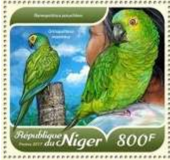
TEPUI PARROTLET, Nannopsittaca panychlora Psittacidae Niger, 2017 December 28, not yet cataloged, 800fr

Length: 6 inches, sexes similar, resident. Green, paler below with yellow chin, lores, and behind the eyes.