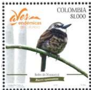
SOOTY-CAPPED PUFFBIRD, Nystactes noanamae Bucconidae Colombia, 2018 January 23, not yet cataloged, 1000p

Length: 29 inches, sexes similar, resident. Silvery-gray above and white below with a blackish bill, narrow casque, and stripe behind the eye. Habitat: Forest, parks, and gardens. Range: Northeastern Pakistan to northwestern Bangladesh and India (except coasts). Reference: del Hoyo, J., A. Elliott, and J. Sargatal, Eds. Handbook of the Birds of the World, Volume 6.