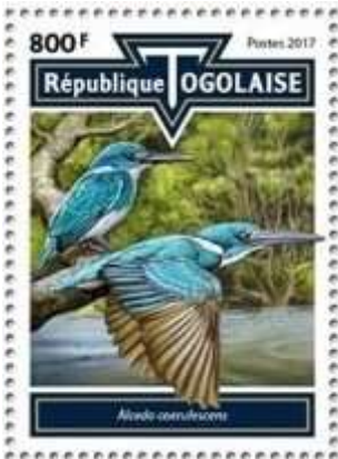
SMALL BLUE KINGFISHER, Alcedo coerulescens Alcedinidae Togo, 2017 December 15, not yet cataloged, 800fr