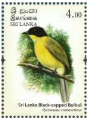
BLACK-CAPPED BULBUL, Pycnonotus melanicterus Pycnonotidae Sri Lanka, 2017 December 16, not yet cataloged, 4r