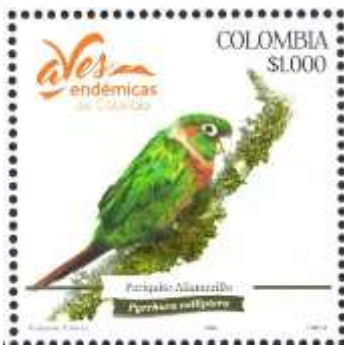
BROWN-BREASTED PARAKEET, Pyrrhura calliptera Psittacidae Colombia, 2018 January 23, not yet cataloged, 1000p

Reference: del Hoyo, J., A. Elliott, and J. Sargatal, Eds. Handbook of the Birds of the World, Volume 4.