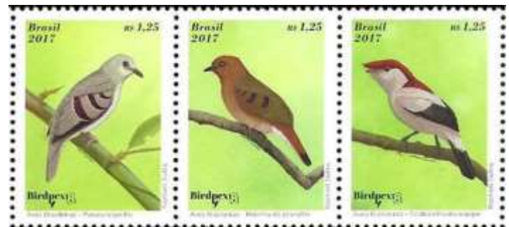
BIRDPEX 2018 Brazil, 2017, Sc#3352

At least five countries have already issued sets of stamps depicting birds that commemorate the BIRDPEX exhibition. One should expect that other countries will jump on board with more issues.