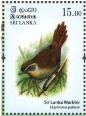
SRI LANKA BUSH-WARBLER, Elaphornis palliseri Sylviidae Sri Lanka, 2017, not yet cataloged, 35r

Length: 6 inches, sexes similar, resident. Olive-brown above and olive-gray below with black-streaked gray ear coverts.