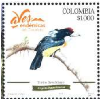
WHITE-MANTLED BARBET, Capito hypoleucus Capitonidae Colombia, 2018 January 23, not yet cataloged, 1000p

Length: 7 inches, sexes alike, resident. Blackish above and buffy below with a broad black pectoral band, grayish black cap, and white throat. Habitat: Lowland forest. Range: Coastal western Colombia. Reference: del Hoyo, J., A. Elliott, and J. Sargatal, Eds. Handbook of the Birds of the World, Volume 7.