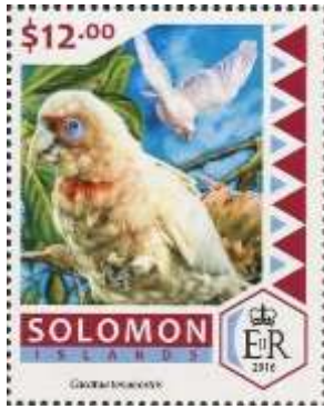
LONG-BILLED CORELLA, Cacatua tenuirostris Cacatuidae Solomon Islands, 2016 December 12, Sc#2180a, $12

Length: 15 to 16 inches, sexes similar, resident. White with an orange-scarlet forehead, blue eye patches, and a scarlet band across the throat.