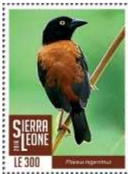
VIEILLOT'S WEAVER, Ploceus nigerrimus ssp. castaneofuscus Ploceidae Sierra Leone, 2016 May 9, Sc#3747, 300le