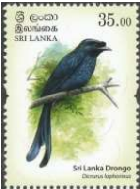
SRI LANKA DRONGO, Dicrurus lophorinus Dicruridae Sri Lanka, 2017 December 16, not yet cataloged, 35r