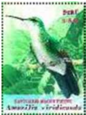
GREEN-AND-WHITE HUMMINGBIRD, Amazilia viridicauda Trochilidae Peru, 2018 January 15, not yet cataloged, 8s

Length: 4 inches, sexes similar, resident. Green above and white below with green spots on the sides of the chin and throat.