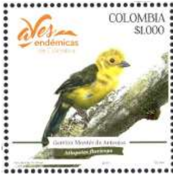
YELLOW-HEADED BRUSH-FINCH, Atlapetes flaviceps Emberizidae Colombia, 2018 January 23, not yet cataloged, 1000p

Length: 7 inches, sexes alike, resident. Olive above and yellow below with a grizzled yellow head.