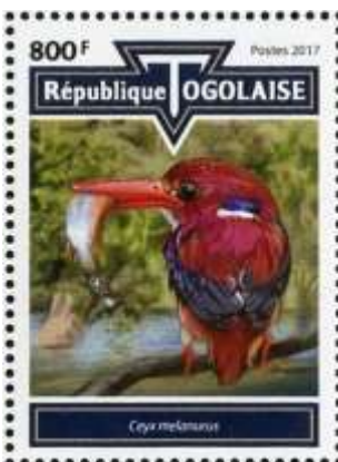
PHILIPPINE DWARF-KINGFISHER, Ceyx melanurus Alcedinidae Togo, 2017, not yet cataloged, 800fr