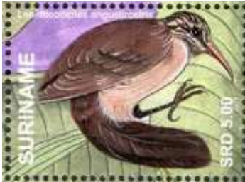
NARROW-BILLED WOODCREEPER, Lepidocolaptes angustirostris Furnariidae