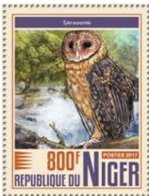
GOLDEN MASKED-OWL, Tyto aurantia Tytonidae Niger, 2017 November 20, not yet cataloged, 800fr

Length: 11 to 13 inches, sexes similar, resident. Black-mottled golden-buff with a whitish facial disc.