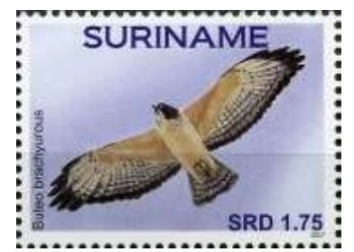
the World, Volume 2.