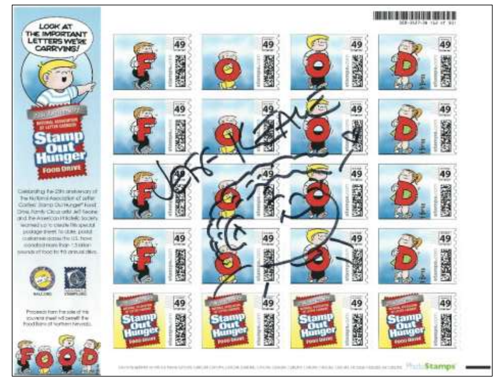
Personalized postage souvenir sheet with Family Circus images Autographed by artist Jeff Keane

A vintage 1929 Ford mail truck was on display by the NALC booth courtesy of the National