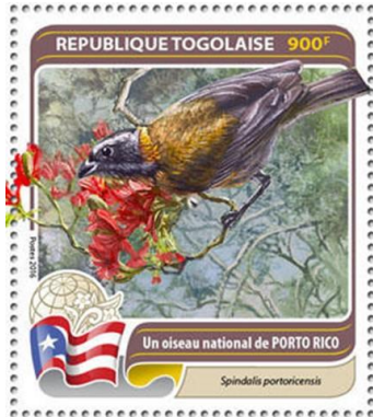
PUERTO RICAN SPINDALIS, Spindalis portoricensis Thraupidae Togo, 2016 November 16, not yet cataloged, 900fr

Length: 7 inches, resident. The male (shown) is olive green above and yellow below with a white-striped black head and an orange collar. The female is olive-brown above and pale sandy buff below with a whitish supercilium and a yellowish collar.