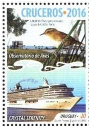
WREN-LIKE RUSHBIRD, Phleocryptes melanops Furnariidae Uruguay, 2016 December 1, not yet cataloged, 20p