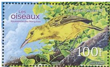
SOUTHERN MARQUESAN REED-WARBLER, Acrocephalus mandanae Acrocephalidae