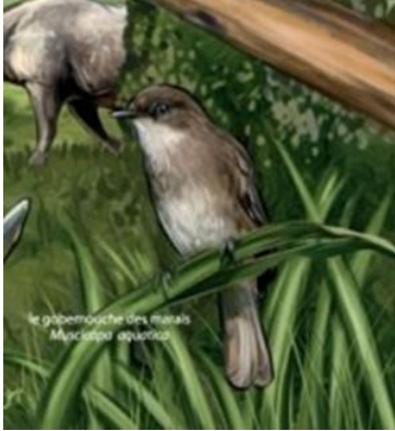
DUSKY BROWN FLYCATCHER, Muscicapa adusta Muscicapidae Togo, 2011 September 28, Yv#517, 3000fr (LR margin)

Length: 5 inches, sexes alike, resident. Uniform dark brown above, paler below with a white throat.