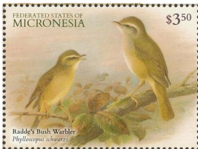
RADDE'S WARBLER. Phylloscopus schwarzi Phylloscopidae Micronesia, 2015 April 16, not yet cataloged, $3.50

Reference: del Hoyo, J., A. Elliott, and J. Sargatal, Eds. Handbook of the Birds of the World , Volume 13.