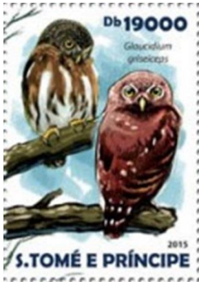
CENTRAL AMERICAN PYGMY-OWL, Glaucidium griseiceps Strigidae St. Thomas and Prince, 2015 May 21, not yet cataloged, 19000d

Length: 5 to 7 inches, sexes alike, resident. Brown with false eyes above (right) and white with rufous-brown streaks below (left).