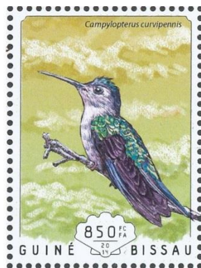
WEDGE-TAILED SABREWING, Campylopterus curvipennis Trochilidae Guinea-Bissau, 2014 November 5, not yet cataloged, 850fr