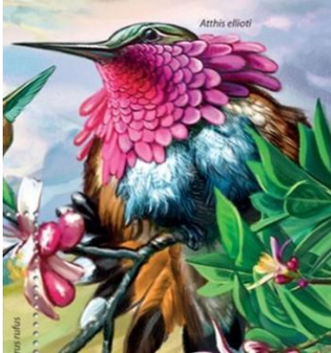
WINE-THROATED HUMMINGBIRD, Atthis ellioti Trochilidae Niger, 2015 April 20, not yet cataloged, 3000fr (R margin)

Length: 3 inches, resident. The male (shown) is green above and white below with an iridescent rose-pink throat and cinnamon flanks. The female has a gray-spotted white throat.