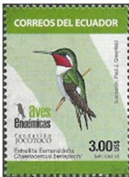
ESMERALDAS WOODSTAR, Chaetocercus berlepschi Trochilidae Ecuador, 2015 June 16, not yet cataloged, $3