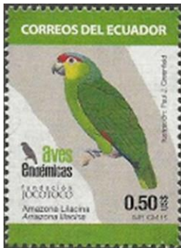
LILACINE PARROT, Amazona autumnalis lilacina Psittacidae Ecuador, 2015 June 16, not yet cataloged, 50c (A ssp. of Red-lored Parrot)