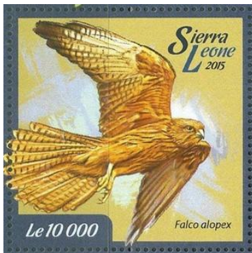
FOX KESTREL, Falco alopex Falconidae Sierra Leone, 2015 May 22, not yet cataloged, 10000le