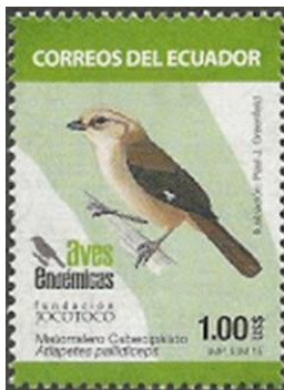
PALE-HEADED BRUSH-FINCH. Atlapetes pallidiceps Emberizidae Ecuador, 2015 June 16, not yet cataloged, $1