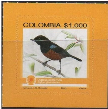
CHESTNUT-BELLIED FLOWERPIERCER, Diglossa gloriosissima Emberizidae