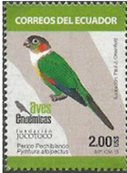
WHITE-NECKED PARAKEET. Pyrrhura albipectus Psittacidae Ecuador, 2015 June 16, not yet cataloged, $2

Length: 10 inches, sexes alike, resident. Green with yellow breast and vent, brownish crown, and orange ears.