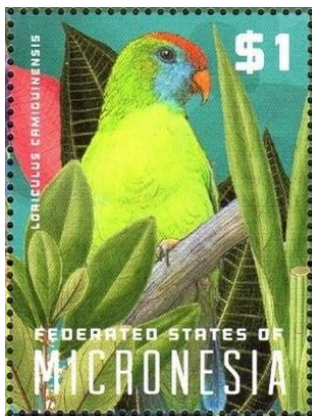
CAMIGUIN HANGING-PARROT, Loriculus camaguinensis Psittaculidae Micronesia, 2014 March 24, not yet cataloged, $1