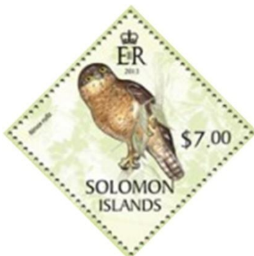
RUFIOUS OWL Ninox rufa Strigidae