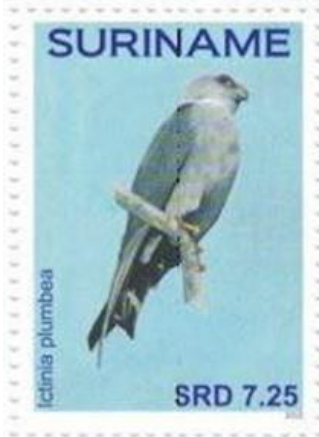
PLUMBEOUS KITE, Ictinia plumbea Accipitridae Surinam, 2015 March 18, not yet cataloged, $7.25

Length: 14 to 15 inches, sexes alike, migratory. Blackish slate gray, pale gray head and below,