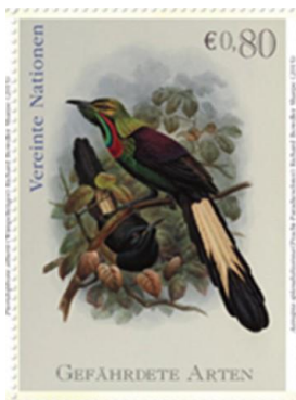
SPLENDID ASTRAPIA, Astrapia splendidissima Paradisaeidae United Nations (Vienna), 2015 April 16, not yet cataloged, 80c