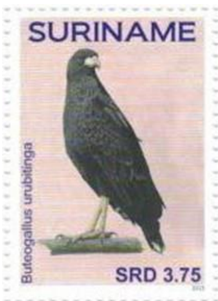
GREAT BLACK HAWK, Buteogallus urubitinga Accipitridae Surinam, 2015 March 18, not yet cataloged, $3.75