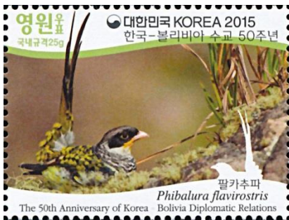
PALKACHUPA COTINGA, Phibalura (flavirostris) boliviana Cotingidae Recent split from the Swallow-tailed Cotinga is not yet in Clements. South Korea, 2015 April 24, not yet cataloged, 2.50w. Also on a joint issue Bolivia stamp.