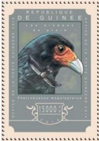
MOUNTAIN CARACARA, Phalcoboenus megalopterus Falconidae Guinea, 2014 October 27, not yet cataloged, 15000fr

Length: 19 to 22 inches, sexes alike. Glossy black with a white belly and undertail. Habitat: Treeless mountains.