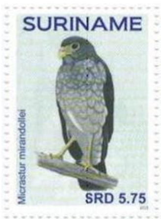
SLATY-BACKED FOREST-FALCON, Micrastur mirandollei Falconidae Surinam, 2015 March 18, not yet cataloged, $5.75