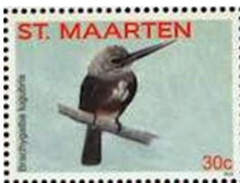
BROWN JACAMAR, Brachygalba lugubris Galbulidae St. Martin, 2015 January 14, not yet cataloged, 30c