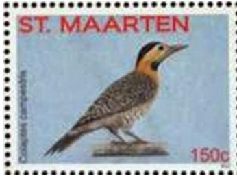
CAMPO FLICKER , Colaptes campestris Picidae St. Martin, 2015 January 14, not yet cataloged, 150c

Length: 11 to 12 inches, resident. The male (shown) is barred dark brown above and barred or spotted whitish below with golden-buff ears to upper breast and a black malar area. The female has a black-and-white malar area.