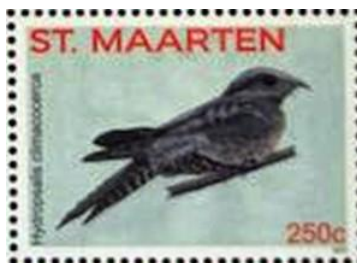
LADDER-TAILED NIGHTJAR, Hydropsalis climacocerca Caprimulgidae St. Martin, 2015 January 14, not yet cataloged, 250c