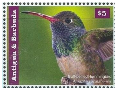
BUFF-BELLIED HUMMINGBIRD, Amazilia yucatanensis Trochilidae Antigua, 2015 January 2, not yet cataloged, $5