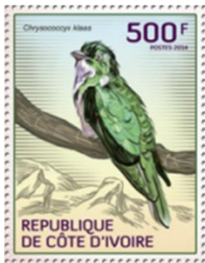
KLAAS'S CUCKOO, Chrysococcyx klaas Cuculidae Ivory Coast, 2014 March 10, not yet cataloged, 500fr