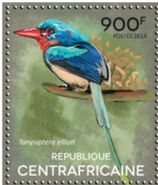
KOFIAU PARADISE-KINGFISHER, Tanyisptera ellioti Alcedinidae Central African Republic, 2014 December 15, not yet cataloged, 900fr