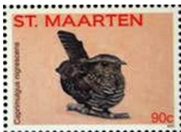
BLACKISH NIGHTJAR, Nyctipolis nigrescens Caprimulgidae St. Martin, 2015 January 14, not yet cataloged, 90c

Length: 7.5 to 8.5 inches, resident. The male (shown) is mottled black above and buff-barred dark brown below with white spots on the wings and tail. The female lacks the white spots.