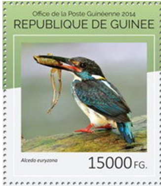
BLUE-BANDED KINGFISHER, Alcedo euryzona Alcedinidae Guinea, 2014 October 20, not yet cataloged, 1500fr

Length: 7 inches, resident. The male (shown) is blue above and white below with a broad blue band on the breast and rufous and white neck patches. The female has a rufous belly.