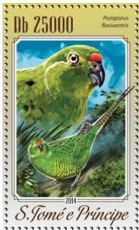
GROUND PARROT , Pezoporus wallicus Psittaculidae St. Thomas and Prince, 2014 October 15, not yet cataloged, 25000d