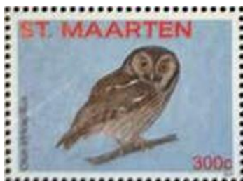
BLACK-CAPPED SCREECH-OWL, Megascops atricapilla Strigidae St. Martin, 2015 January 14, not yet cataloged, 300c