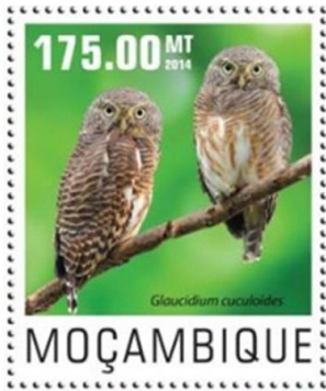
ASIAN BARRED OWLET, Glaucidium cuculoides Strigidae Mozambique, 2014 August 20, not yet cataloged, 175m SS

Length: 9 to 10 inches, sexes alike, resident. Buff-barred brown above and brown-barred white below with a buff-barred gray-brown head.