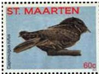
RUFOUS NIGHTJAR, Antrostomus rufus Caprimulgidae St. Martin, 2015 January 14, not yet cataloged, 60c