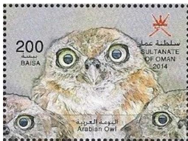
ARABIAN SCOPS-OWL, Otus pamela Strigidae Oman, 2014 December 14, not yet cataloged, 200b