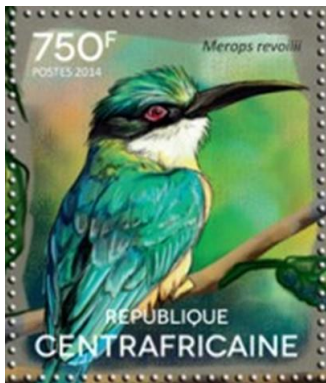
SOMALI BEE-EATER, Merops revoillii Meropidae Central African Republic, 2014 December 15, not yet cataloged, 750fr