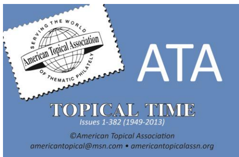
Topical Time Digital Archive

The American Topical Association (ATA) has released a complete digital archive of all Topical Time issues from 1949 through 2013. It contains 382 issues of the thematic journal, totaling about 34,272 pages, in electronically searchable Portable Document Format (PDF) files. The Archive is housed in a 16-gigabyte wafer-style flash drive the size of a credit card. It plugs into Universal Service Bus (USB) ports on both Windows and Apple devices.