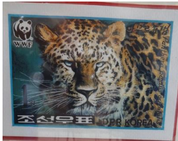
WWF Logo North Korea