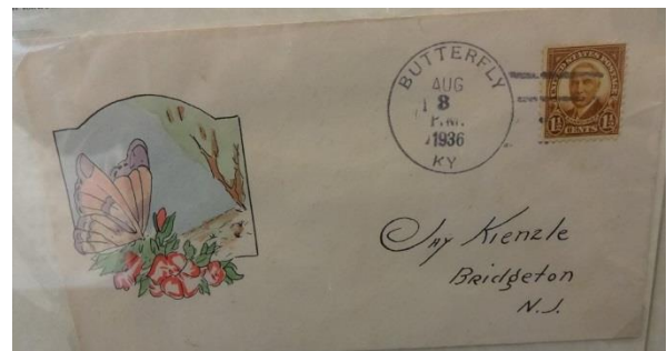
Butterflies Pay Horace's Pond a Visit