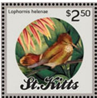
BLACK-CRESTED COQUETTE, Lophornis helenae Trochilidae St. Kitts, 2013, not yet cataloged, $2.50