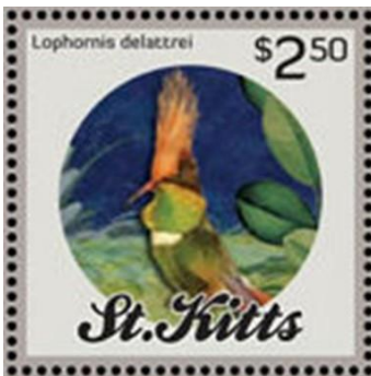
RUFOUS-CRESTED COQUETTE, Lophornis delattrei Trochilidae St. Kitts, 2013, not yet cataloged, $2.50 (Previously on a local from Bernera.)