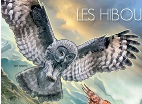
RUSTY-BARRED OWL, Strix hylophila Strigidae Burundi, 2012 December 21, Sc#1225, 7500fr SS (UL margin)

Length: 14 inches, sexes alike, resident, barred brown above and barred white below with a rusty-brown facial disk with concentric rings.