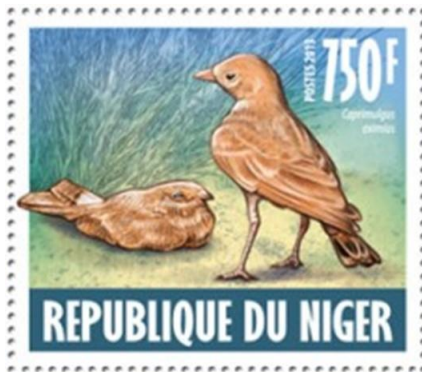
BAR-TAILED LARK . Ammomanes cinctura Alaudidae Niger, 2013 September 30, not yet cataloged, 750fr (right-hand bird)