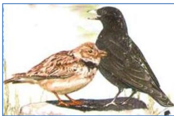
BLACK LARK , Melanocoryphus yeltoniensis Alaudidae Kazakhstan, 2013 December 25, not yet cataloged, 150t