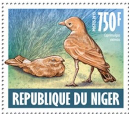
GOLDEN NIGHTJAR, Caprimulgus eximius Caprimulgidae Niger, 2013 September 30, not yet cataloged, 750fr (left-hand bird)