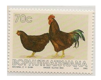
Rhode Island Red Bophuthatswana Sc#284