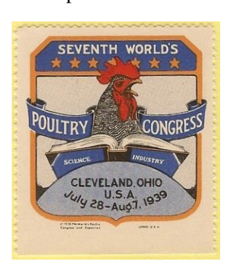
Plymouth Rock Poster Stamp

The Plymouth Rock is an American original. The most popular breed in the world was developed in New England in the middle of the 19th Century. The Barred Plymouth Rock has distinctive black and white bars, or stripes. There are also white, black, buff, and silver Plymouth Rocks. In addition to their prolific laying, they are docile and friendly. They can tolerate all kinds of weather and have few health problems.