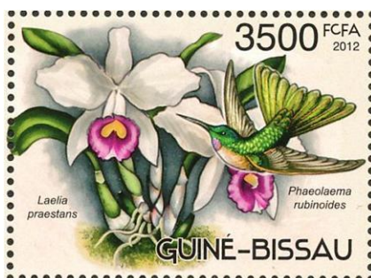
FAWN-BREASTED BRILLIANT, Heliodoxa rubinoides Trochilidae Guinea-Bissau, 2012 May 25, Yv#777, SS 3500fr