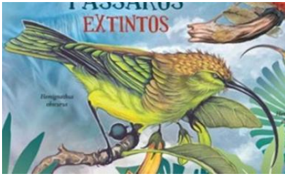
LESSER AKIALOA, Hemignathus obscura Drepanididae Mozambique, 2012 April 30, Sc#2621, SS 175m (LL margin)

Length: 6.5 inches, sexes alike, resident. Green above, paler below with a curved bill.