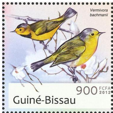
BACHMANN'S WARBLER, Vermivora bachmanii Parulidae Guinea-Bissau, 2012 October 31, Yv#4636, 900fr