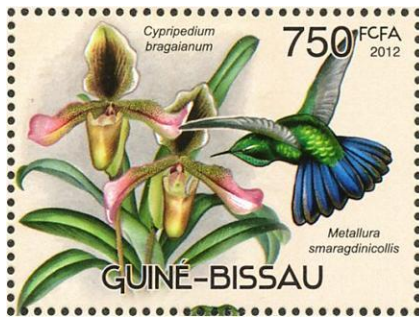
TYRIAN METALTAIL, Metallura tyrianthina Trochilidae Guinea-Bissau, 2012 May 25, Yv#4339, 750fr

Length: 4 inches, resident. The male is bottle-green above and grayish below with an emerald-green throat patch and a coppery-red or violet tail. The female has whitish underparts with green spots, an ochre-orange throat, and coppery-red tail.