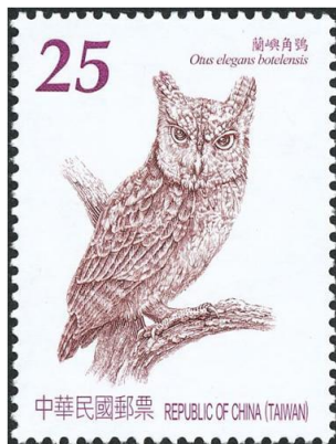
RYUKYU SCOPS-OWL, Otus elegans Strigidae Taiwan, 2013 June 26, not yet cataloged, $25