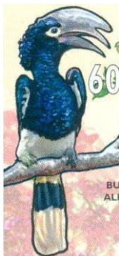
WHITE-THIGHED HORNBILL, Ceratogymna albotibialis Bucerotidae Congo D.R., 2012 October 22, not yet cataloged, 600fr