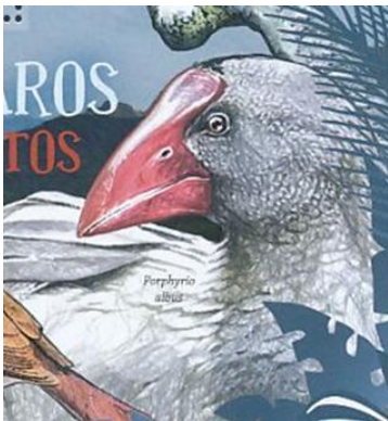
LORD HOWE'S SWAMPHEN, Porphyrio albus Rallidae Mozambique, 2012 April 30, Sc#2641, SS 175m (LR margin)