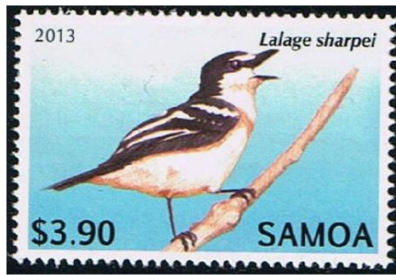
SAMOAN TRILLER, Lalage sharpei Campephagidae Samoa, 2013 May 29, not yet cataloged, $3.90

Length: 5 inches, sexes alike, resident. Gray-brown above and finely-barred paler below with a red-orange bill.