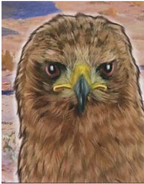
WAHLBERG'S EAGLE, Hieraaetus wahlbergi Accipitridae Niger, 2013 March 1, Sc#1167, SS 2500fr (LR margin)