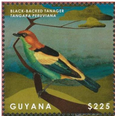
BLACK-BACKED TANAGER, Tangara peruviana Thraupidae Guyana, 2013, not yet cataloged, $225

Length: 5.5 inches, migratory. The male (shown) is pale above and bluish below with a black back, rufous-chestnut head and blue and black wings. The female is greenish above and blue-green below with a cinnamon-rufous head.