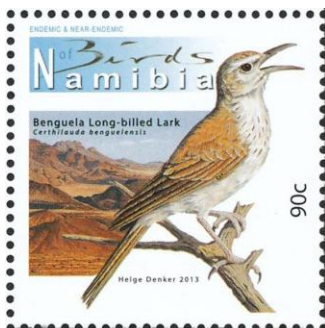
BENGUELA LARK, Certhilauda benguelensis Alaudidae Namibia, 2013 March 1, Sc#1254, 90c