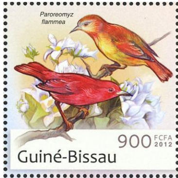
KĀKĀWAHIE, Paroreomyza flammea Drepanididae Guinea-Bissau, 2012 October 31, Yv#4634, 900fr