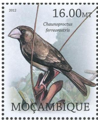
BONIN GROSBEAK, Chaunoproctus ferreorostris Fringillidae Mozambique, 2012 April 30, Sc#2633c, 16m