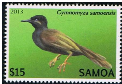
MAO, Gymnomyza samoensis Meliphagidae Samoa, 2013 May 29, not yet cataloged, $15