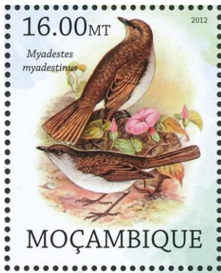
KĀMA‘O, Myadestes myadestinus Turdididae Mozambique, 2012 April 30, Sc#2607c, 16m

Length: 8 inches, sexes alike, resident. Brown above and faintly mottled gray below. Habitat: Dense montane forest.