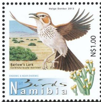
BARLOW'S LARK, Certhilauda barlowi Alaudidae Namibia, 2013 March 1, Sc#1255, $1