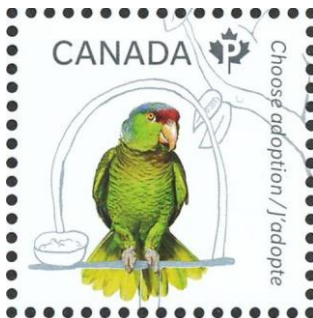
LILAC-CROWNED PARROT, Amazona finschi Psittacidae Canada, 2013 April 22, Sc#2636b, (63c)