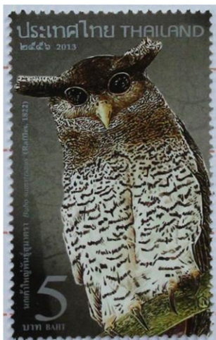
BARRED EAGLE-OWL, Bubo sumatranus Strigidae Thailand, 2013 July 29, not yet cataloged, 5b

Reference: del Hoyo, J., A. Elliott, and J. Sargatal, Eds. Handbook of the Birds of the World, Volume 5.