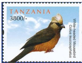
WHITE-HEADED MOUSEBIRD, Colius leucocephalus Coliidae Tanzania, 2011 November 20, Sc#2639, SS 3800sh