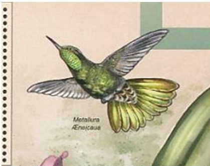
SCALED METALTAIL, Metallura aeneocauda Trochilidae Guinea-Bissau, 2012 May 25, Yv#777. SS 3500fr (UR margin)