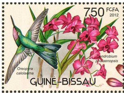
PURPLE-THROATED MOUNTAIN-GEM, Lampornis calolaemus Trochilidae