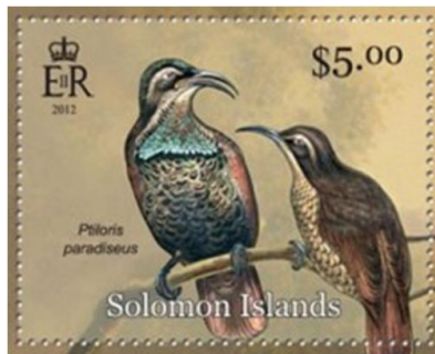
PARADISE RIFLEBIRD, Ptiloris paradiseus Paradisaeidae Solomon Islands, 2013 February 15, not yet cataloged, $5