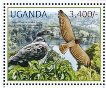
BEAUDOUIN'S SNAKE-EAGLE, Circus beaudouini Accipitridae Uganda, 2012 March 30, Yv#2333, 3400sh

Length: 24 inches, sexes alike, resident. Brown above and brown-barred white below with a dark chest.