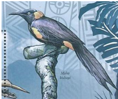
BISHOP'S 'Ō'Ō, Moho bishopi Meliphagidae Mozambique, 2012 April 30, Sc#2641, SS 175m (UR margin)