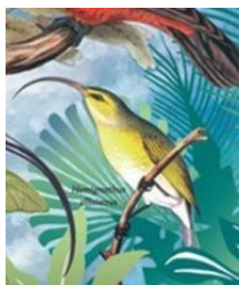
GREATER AKIALOA, Hemignathus ellisianus Drepanididae Mozambique, 2012 April 30, Sc#2621, SS 175m (LR margin)