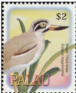
GREAT THICK-KNEE, Esacus recurvirostris Burhinidae Palau, 2002 February 20, Sc#664, $2 (This was not written up when issued.)