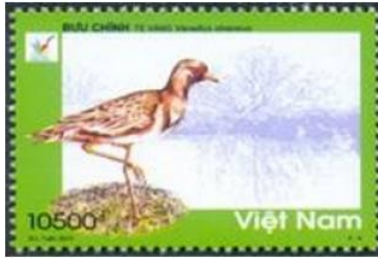
GRAY-HEADED LAPWING, Vanellus cinereus Charadriidae Vietnam, 2013 June 1, not yet cataloged, 10500d

Length: 14 to 15 inches, sexes alike, migratory. Brown above and white below with a gray head, neck, and upper breast and a black breast band.