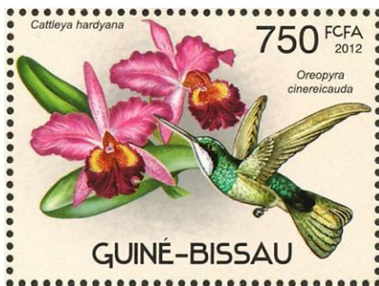
GRAY-TAILED MOUNTAIN-GEM, Lampornis cinereicauda Trochilidae