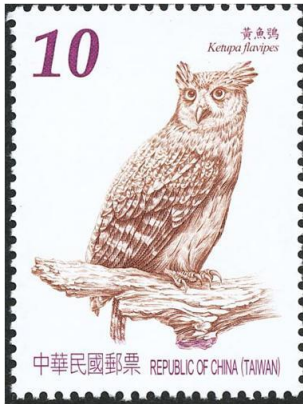
TAWNY FISH-OWL, Ketupa flavipes Strigidae Taiwan, 2013 June 26, not yet cataloged, $10

Length: 19 to 22 inches, sexes alike, resident. Orange-rufous with black streaks below and horizontal ear tufts.