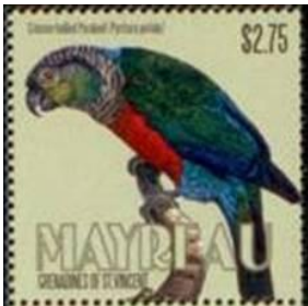
CRIMSON-BELLIED PARAKEET, Pyrrhura perlata Psittacidae St Vincent-Grenadines (Mayreau), 2011, not yet cataloged, $2.75

Length: 10 inches, sexes alike, resident. Green above with a scaled buff neck and breast and red belly.