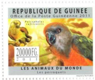
RED-BELLIED PARROT, Poicephalus rufiventris Psittacidae Guinea, 2011, not yet cataloged, 20,000 francs

Length: 10 inches, resident. The male (shown on the stamp) is brown above with a grayish-brown head, orange red breast and green belly; the female has a grayish-brown breast.