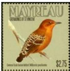
SCALE-BACKED ANTBIRD, Willisornis poecilinotus Thamnophilidae St Vincent-Grenadines (Mayreau), 2011, not yet cataloged, $2.75