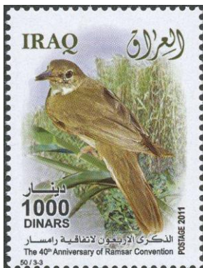
BASRA REED-WARBLER, Acrocephalus griseldis Sylviidae Iraq, 2011, not yet cataloged, 1000L