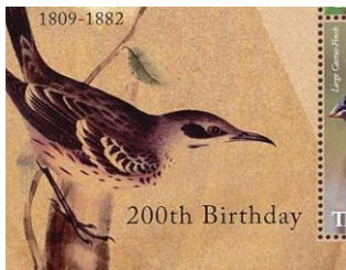
SAN CRISTOBAL MOCKINGBIRD, Mimus melanotis Mimidae Gambia, 2010, 3240, margin