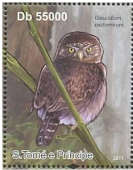
NORTHERN PYGMY-OWL, Glaucidium californicum Strigidae Sao Tome, 2011, not yet cataloged, 55000d

Length: 15 inches, sexes alike, resident. Gray or rufous above and streaky white below with fine white spots on the head and yellow eyes.