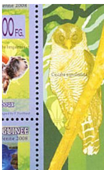
BLACK-AND-WHITE OWL, Ciccaba nigrolineata Strigidae Guinea, 2008, upper-right margin (false color)

Reference: del Hoyo, J., A. Elliott, and J. Sargatal, Eds. Handbook of the Birds of the World, Volume 5