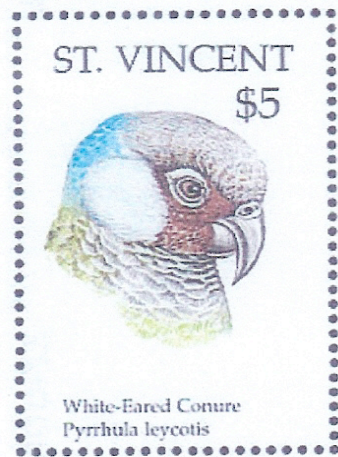
WHITE-EARED CONURE Weight: 2.3oz (65g) Length: 8½in (21cm)