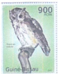
BALSAS SCREECH OWL, Megascops seductus Strigidae Guinea-Bissau, 2010, not yet cataloged, 900f

Length: 10 inches, sexes alike, resident. Brown above and whitish below with brown eyes and a greenish bill.