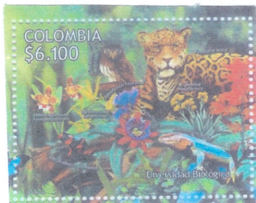
CLOUD-FOREST PYGMY OWL, Glaucidium nubicola Strigidae

Colombia, 2011, not yet cataloged, 6100p