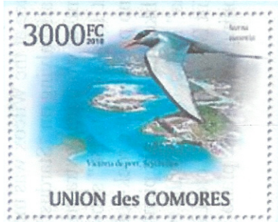
RIVER TERN, Sterna aurantia Laridae Comoro Islands, 2010, not yet cataloged, 3000f

Length: 15 to 18 inches, sexes alike, resident. Dark gray above and white below with a black crown, bright yellow bill, red legs and a deeply forked tail.