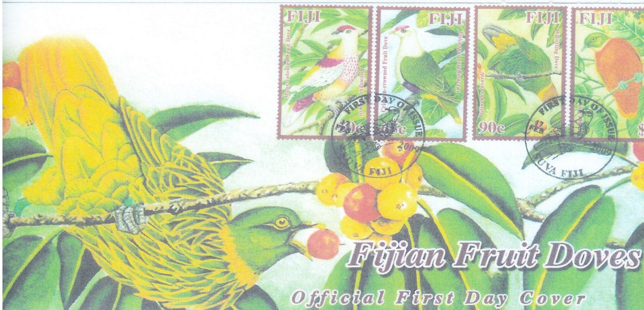
GOLDEN DOVE, Ptilinopus luteovirens Columbidae Fiji, 2009, 1210-1213 First Day Cover