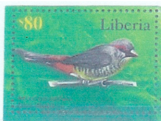
RED-FACED CISTICOLA, Cisticola erythrops Cisticolidae Liberia, 2011, not yet cataloged, $80