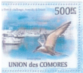
WHITE-CHEEKED TERN, Sterna repressa Laridae Comoro Islands, 2010, not yet cataloged, 500f

Reference: del Hoyo, J., A. Elliott and J. Sargatal, Eds. Handbook of the Birds of the World, Volume 3.