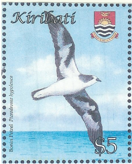
BONIN PETREL, Pterodroma hypoleuca Procellariidae (011.034) Kiribati, 2008, not yet cataloged, $5

A number of British local stamps showing species not otherwise shown on stamps have been written up in this column. These issues were originally used to pay for transport of mail from islands off Scotland to government post offices on the mainland. Later, many stamps were issued for which no real need existed. These were primarily for tourists and collectors. Most were topical stamps; many showed birds. The bird names on the stamps aren't much help (as shown for birds already written up), and some of the artwork isn't very good. In this issue I have written up all that I can identify. All of these were issued more than twenty-five years ago.