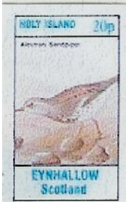
ROCK SANDPIPER, Calidris ptilocnemis Scolopacidae (062.081) Eynhallow, 1982, 20 pence

Length: 8 to 9 inches, sexes alike, migratory. Patchy pale head, streaky below (black breast patch in breeding plumage) with a dark tail.