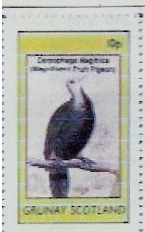
WOMPOO FRUIT-DOVE, Ptilinopus magnificus Columbidae (072.225) Grunay, 1982, 10 pence