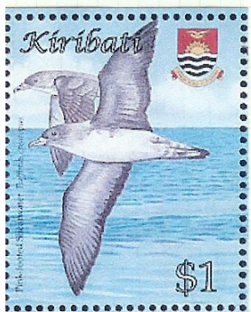
PINK-FOOTED SHEARWATER, Puffinus creatopus Procellariidae (011.058)