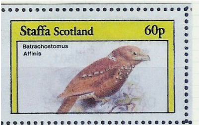
JAVAN FROGMOUTH, Batrachostomus javensis Podargidae (081.011) Staffa, 1982, 60 pence