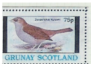
VOLCANO JUNCO, Junco vulcani Embirizidae (201.310) Grunay, 1982, 1982, 75 pence

Length: 6.5 inches, sexes alike, resident. Brown above and grayish below.