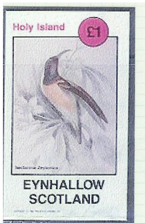
PURPLE-RUMPED SUNBIRD, Leptocoma zeylonica Nectariniidae (164.042)