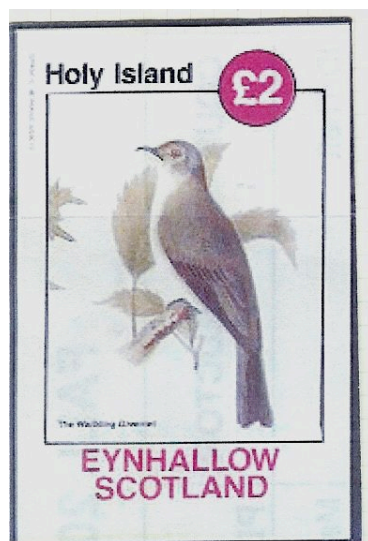
GRAY-CHESTED GREENLET (Probable), Hylophilus semicinereus Vireonidae (193.035) Eynhallow, 1982, 2 pounds

Reference: Sinclair, I. and P. Ryan. Birds of Africa South of the Sahara.