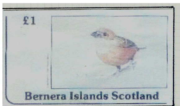
SILVER-THROATED TANAGER, Tangara icterocephala Thraupidae (199.194) Bernera, 1982, 1 pound

Length: 5 inches, sexes similar but the female is duller, resident. Golden yellow with black streaks on the back and a silvery throat patch.