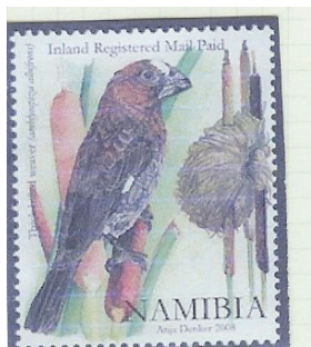
GROSBEAK WEAVER , Amblyospiza albifrons Ploceidae (190.116) Namibia, 2008, not yet cataloged, inland registered mail

Length: 6 to 7 inches, resident. The male (shown on the stamp) is dark brown with a white forehead and small wing patch; the female is whitish below, heavily streaked brown.