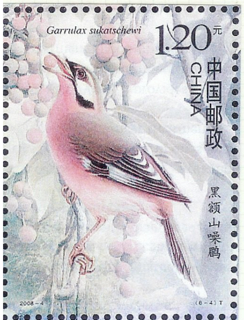
SUKATSCHEV'S LAUGHINGTHRUSH, Garrulax sukatschewi Timaliidae (147.023) China, 2008, not yet cataloged,