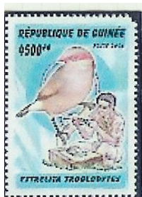
BLACK-RUMPED WAXBILL , Estrilda troglodytes Estrildidae (191.026) Guinea, 2008, not yet cataloged, 4500 francs

Reference: Sinclair, I. and P. Ryan. Birds of Africa South of the Sahara.