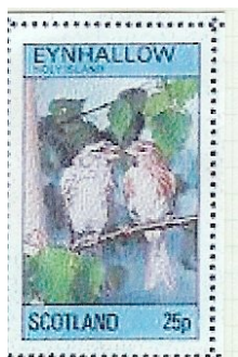
HOARY REDPOLL (Probable), Carduelis hornemanni Fringillidae (194.080) Eynhallow, 1981, 25 pence