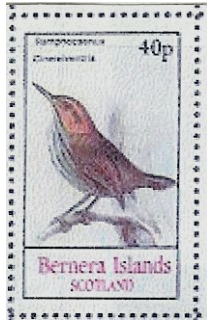
TAWNY-FACED GNATWREN, Microbates cineiventris Polioptilidae (139.002) Bernera, 1982, 40 pence

Length: 4 inches, sexes alike, resident. Brown above and gray below with a rusty face.