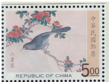
PERE DAVID'S LAUGHINGTHRUSH , Garrulax davidi Timaliidae (147.022)