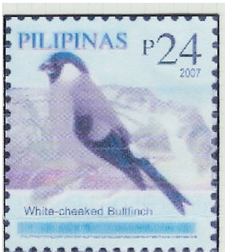
WHITE-CHEEKED BULLFINCH, Pyrrhula leucogenis Fringillidae (194.155) Philippines, 2007, not yet cataloged, 24p