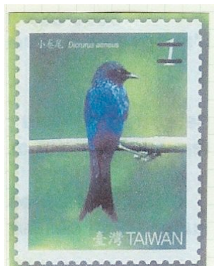
BRONZED DRONGO , Dicrurus aeneus Dicruridae (178.014) China (Taiwan), 2008, not yet cataloged, $1

Reference: Harris, T. and K. Franklin. Shrikes and Bush-Shrikes