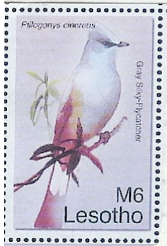
GRAY SILKY-FLYCATCHER , Ptilogonys cinereus Ptilogonatidae (128.002) Lesotho, 2007, not yet cataloged, 6m

Length: 7 to 8 inches, resident. The male (shown on the stamp) is gray with yellowish flanks and white at the base of the undertail; the female is dusky vinaceous above and dull vinaceous below with yellow undertail coverts.