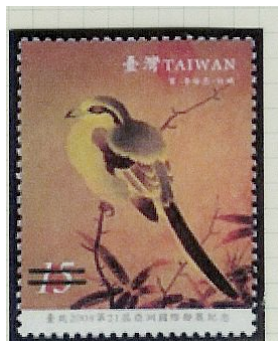
CHINESE GRAY SHRIKE , Lanius sphenocercus Laniidae (174.017) China (Taiwan), 2008, not yet cataloged, $15