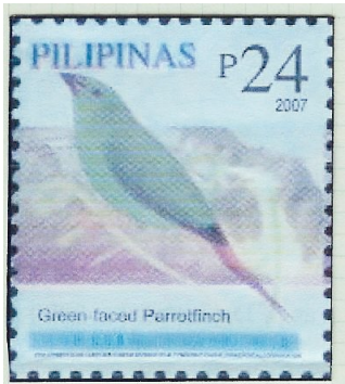
GREEN-FACED PARROTFINCH, Erythrura viridifacies Estrildidae (191.092) Philippines, 2007, not yet cataloged, 24p

Length: 15 inches, sexes alike, resident. Dull brown above and pale gray nape, rump and below with a black face and a small white patch on black wings. Habitat: forest, scrub and second growth. Range: Taiwan to India and Southeast Asia. Reference: King, B.F. and E. C. Dickenson. A Field Guide to the Birds of South-East Asia.