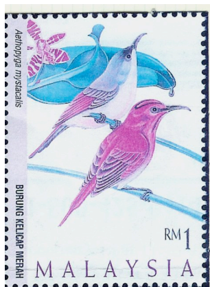
TEMMINCK'S SUNBIRD , Aethopyga temminckii Nectariniidae (164.120) Malaysia, 1997, 608, $1