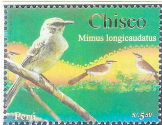
LONG-TAILED MOCKINGBIRD , Mimus longicaudatus Mimidae (134.011)