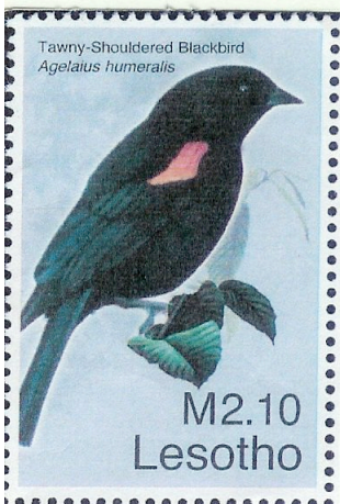
TAWNY-SHOULDERED BLACKBIRD, Agelaius humeralis Icteridae (203.003) Lesotho, 2007, not yet cataloged, 2.10m

Length: 6 to 6.5 inches, sexes similar, but the female is slightly duller, resident. Rich brown above and buff brown below with black cap, wings and tail and white cheeks and rump. Habitat: moist oak forest. Range: Northern Luzon and Mindanao mountains. Clement, P., A. Harris and J. Davis. Finches and Sparrows.