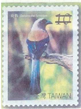
GRAY TREEPIE, Dendrocitta formosae Corvidae (187.055) China (Taiwan), 2008, not yet cataloged, $10

Length: 15 inches, sexes alike, resident. Dull brown above and pale gray nape, rump and below with a black face and a small white patch on black wings. Habitat: forest, scrub and second growth. Range: Taiwan to India and Southeast Asia. Reference: King, B.F. and E. C. Dickenson. A Field Guide to the Birds of South-East Asia.