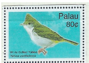
WHITE-BELLIED YUHINA , Yuhina zantholeuca , Timaliidae (147.270) Palau, 2007, not yet cataloged, 80 cents