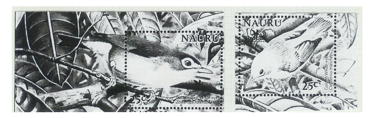
BRIDLED WHITE-EYE, Zosterops conspicillatus Zosteropidae (171.025) Nauru, 2005, 534a, 25 cents (bird on the left)

Length: 4 inches, sexes alike, resident. Greenish above and yellow below with a white eye-ring.