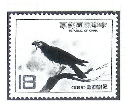
Birds of the World, Volume 2.