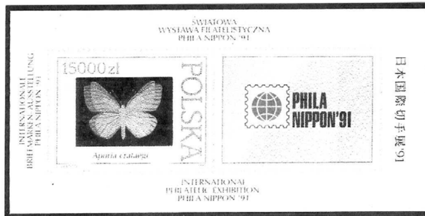
Figure 1. Original Poland Hologram Sheet.

imagine the printer just blocked out a number of stamps on the original sheets make-up and printed the additional details in the spaces remaining. Hopefully someone will be able to contribute more examples.