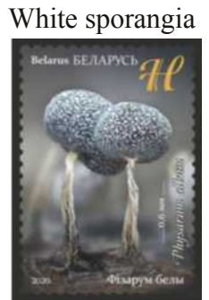
Figure 5: Physarum album on Belarus Scott #1175.

Physarum album is a myxomycete in the family Physaraceae. Common name is many-headed slime. Plasmodium is white or gray. White sporangia are gregarious 1-1.5 mm, erect or nodding, globose or lenticular, contain lime deposits. Stalk yellow, olivaceous or black, tapering, wrinkled. Found on decayed logs and dead trees. Cosmopolitan.