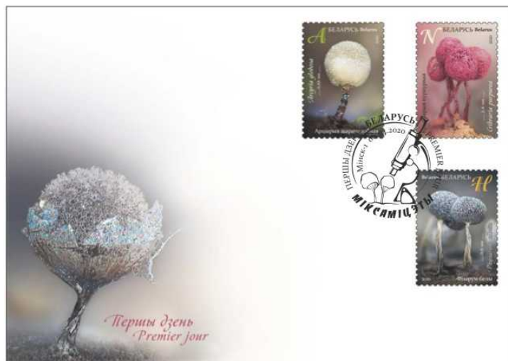
Figure 9: First Day Cover of Belarus Scott #1173-75.

Varieties such as inverted or doubled overprints exist on some of the stamps overprinted at this time, but none have been described for Scott # 826Fi.