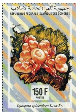
Figure 2: Lycogala epidendrum Scott #811f

nuclear division to form a multinucleate plasmodium. Under adverse conditions they form macrocysts in a structure called a sclerotium.