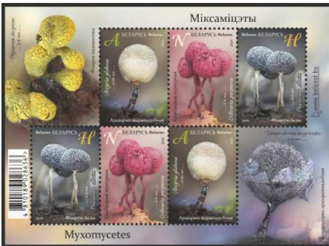
Figure 12: Souvenir sheet Belarus Scott # 1175a.

The souvenir sheet of 6 (Scott #1175a, Figure 12) is 123 x 90 mm and was printed in a quantity of 8,000. The face value of the non-denominated A stamps is 54k on the date of issue and is valid for domestic letters to 20 grams. The value for the N stamp is 1.32r and is valid on postcards sent abroad by surface mail. The H stamp is valued at 1.64r for surface letters to 20 g sent abroad.