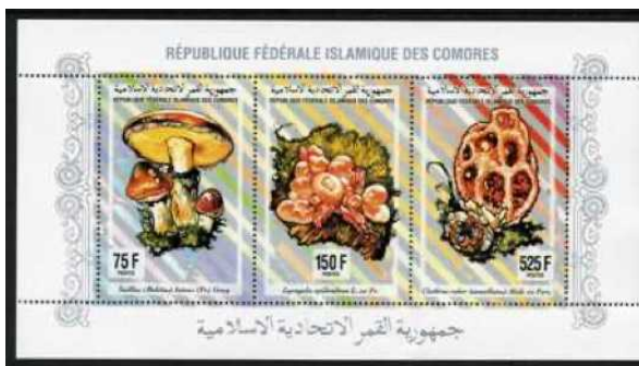
Figure 6: Souvenir sheet of 3, Comoro Islands Scott #811l, with Lycogala epidendrum in the center.

Comoro Islands Scott #811f was issued in a miniature sheet of 9 (Figure 1) and a souvenir sheet of three Scott # 811 (Figure 6). Scott 811 was overprinted and surcharged to 200 fr (Scott #826Fi) in 1997-98 Figure 7. Detail of the overprint is shown in figure 8. There are two sizes of F on overprints on the 525 fr (Scott #811h-j). Most of the overprints were used locally and few mint copies are available.