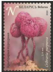
Figure 4: Cribraria purpurea on Belarus Scott #1174.

Cribraria purpurea is a myxomycete in the family Cribrariaceae. Plasmodium red-purple, becoming scarlet before sporulation. Sporocarp 0.6-1 mm diameter, erect with stalk 1.5-2.5 mm purple-red, reddish-purple to purplish-pink. Found on rotten wood. In Japan restricted to sub-alpine forests. (Figure 4 Scott #1174).