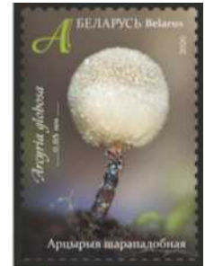
Figure 3: Arcyria globosa on Belarus Scott #1173.

Arcyria globosa is a myxomycete in the family Arcyriaceae. Sporangia globose, 0.36-0.40 mm in diameter, beige. Stalk dark, yellowish by transmitted light, up to 0.32 mm long. Found on bark of trees or dead leaves. South and North America, Europe, Africa and Asia. (Figure 3 Scott # 1173)