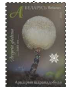
Figure 10: Security marks shown in white are present on the stamps from Belarus.

Belarus Scott#1173-75 (Figure 9) were designed by Marina Yurchik from photographs by Yevgeniy Moroz. They are printed on chalk-surfaced gummed paper in sheets of 6 stamps. 36,000 of each duty were printed by multicolor offset by Republican Unitary Enterprise “Bobruisk Integrated Printing House named after A.T.Nepogodin”. The stamps have an invisible security mark (Figure 10).